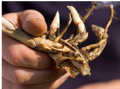
Giant Miscanthus rhizome.

As with other vegetatively propagated crops, adequate soil moisture at planting greatly favors establishment success. Establishment success may be limited by death of plants in the first winter after planting.