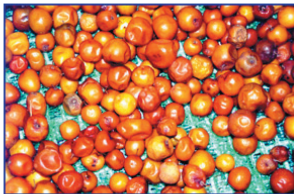
Mature fruits of Ziziphus mauritiana . From: Morton (1987)

The fruit is a drupe with a fleshy pulp and a single, hard stone. It is very variable in shape and size but most are round to oval. Fruits from wild trees can be as small as 1.8-2.5 cm while improved cultivars bear fruits as large as 5 cm in diameter. Both texture and taste of the pulp is similar to apples. The stone has irregular furrows and it normally contains two brown seeds with a papery seedcoat. Seed weight varies and there can be from 500 up to 3300 stones per kg.