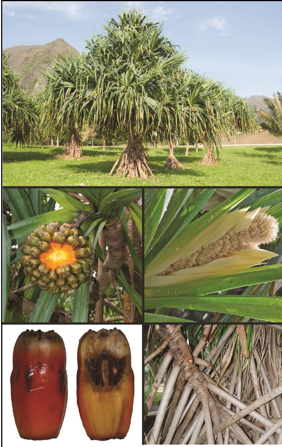
Figure 1. Parts of the pū hala ( P. tectorius ). A small grove of planted trees (top); Infructescence and male inflorescence (middle); A single hala fruit split lengthwise showing the upper floatation tissue, central hard tissue enclosing the several seeds, and the lower sweet tissue (bottom left); and the distinctive prop roots of this species (bottom right).