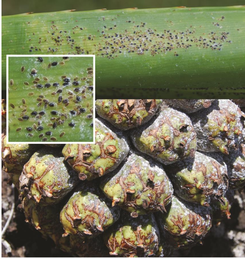
Figure 4. The Pandanus scale Thysanococcus pandani on leaves and fruit of hala at Hana Maui.