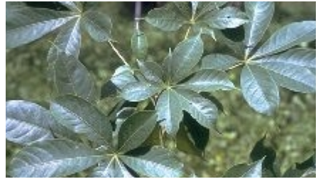
Bombax costatum leaves