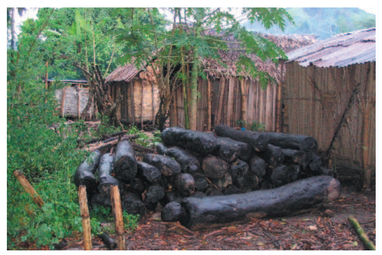
FIGURE 2. Rosewood logs cached near Mandena, 1 km from Marojejy National Park, anonymous.