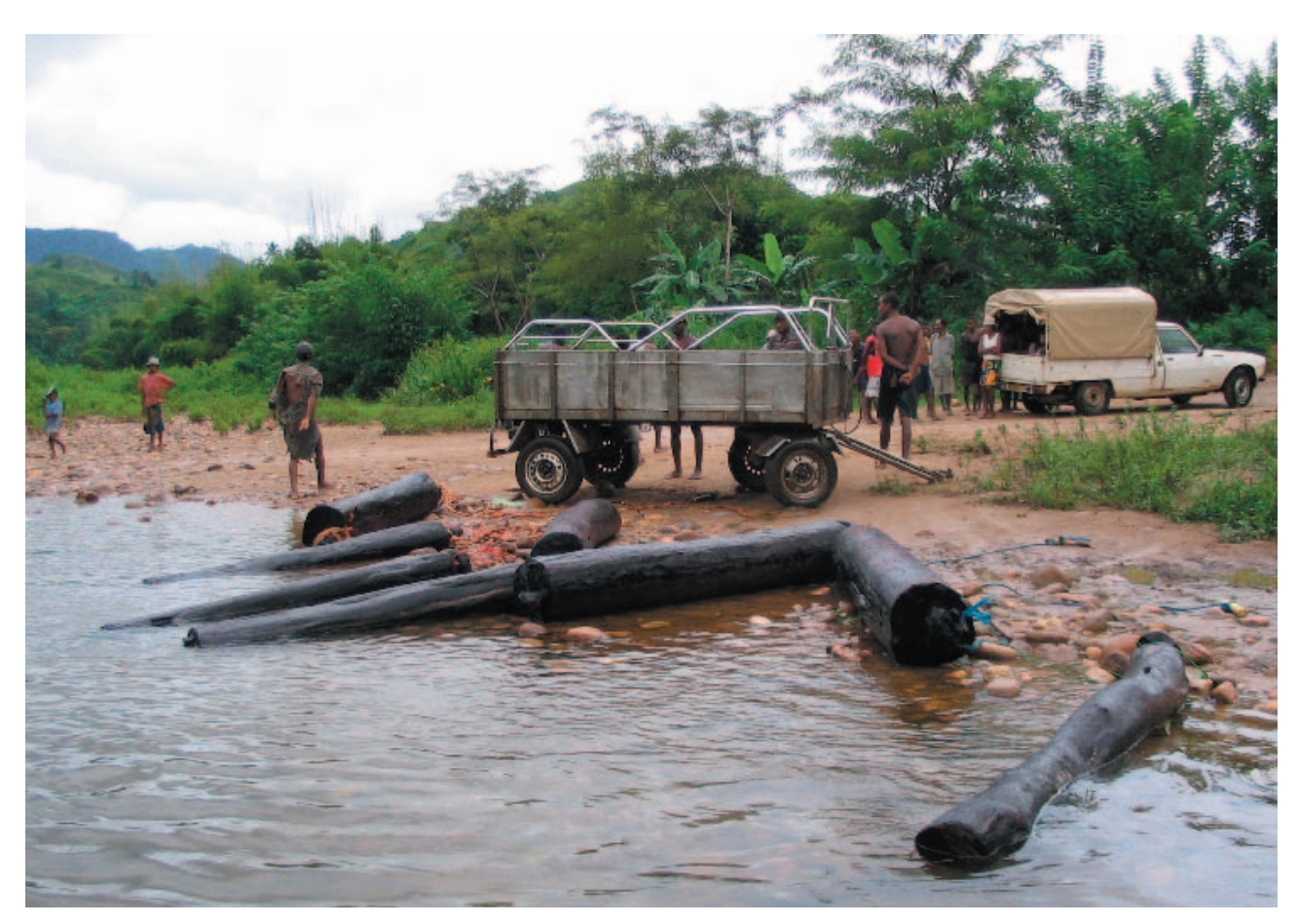
FIGURE 3. 4 km from Marojejy National Park, illegally logged rosewood being transferred from the Manantenina River to ground transport in broad daylight. March 30, 2005. 16:46, anonymous.