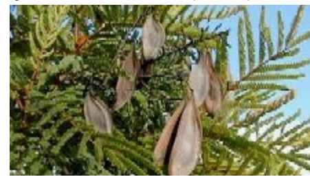
Rough brown bark, longitudinally furrowed. (Ellis RP)