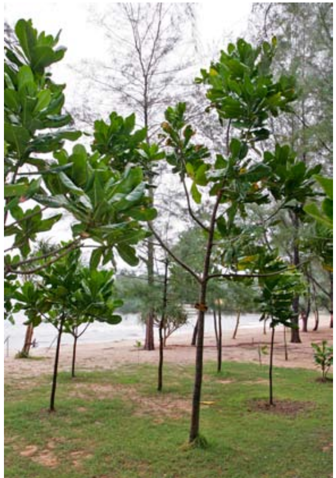
Windbreak of tropical almond and beach she-oak ( Casuarina equisetifolia ).

The foliage is suitable for feeding tasar or katkura silkworms. In the Caribbean, the fruit is an important food for birds and many wild mammals, and it is also consumed by various livestock, including pigs.