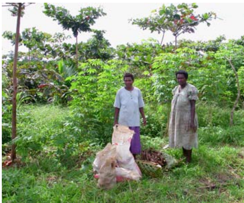
Intercropping with cassava and other crops on Santo, Vanuatu.

Tropical almond has the potential to be well suited to growing in polycultures with other fast-growing timber species such as Endospermum medullosum . The fast-growing but smaller Flueggea flexuosa could be interplanted and harvested after 7–10 years to provide durable poles.