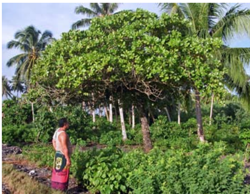
Top: Comparison of flowering twigs of T. littoralis (left) and T. catappa (right). Bottom: T. littoralis, ‘Upolu, Samoa.