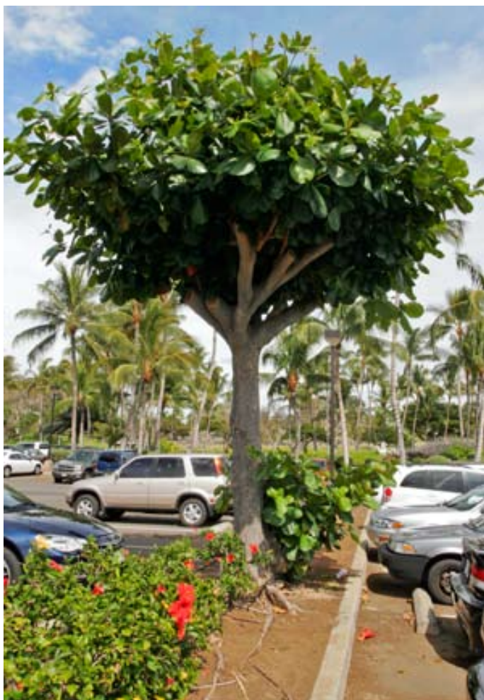
Clockwise from top left: horizontal form of pruned tree, Apia, Samoa; pollarded tree, North Kohala, Hawai‘i; tree in homegarden alongside mango, breadfruit, and rain tree, Apia, Samoa.