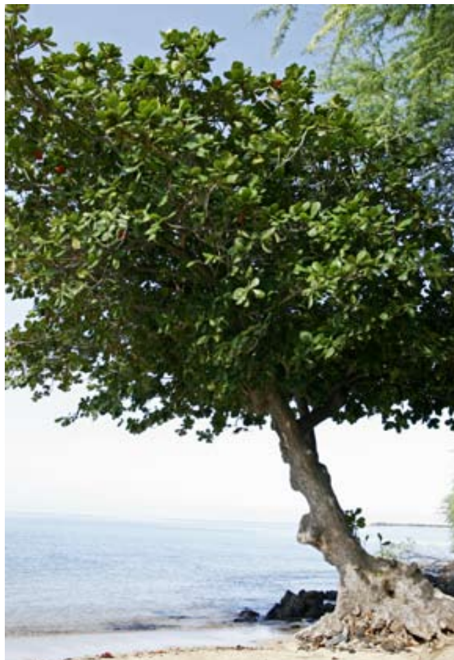
Tropical almond can withstand coastal winds and salt spray.

Tropical almond is adapted to strong, steady coastal winds, as well as rather frequent (every 2–5 years) exposure to