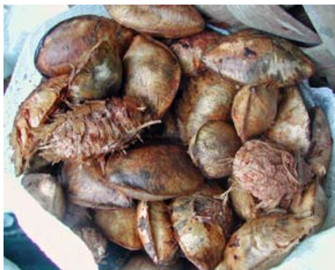
Superior nut morphotypes selected in Solomon Islands and introduced to Tonga in 2002.