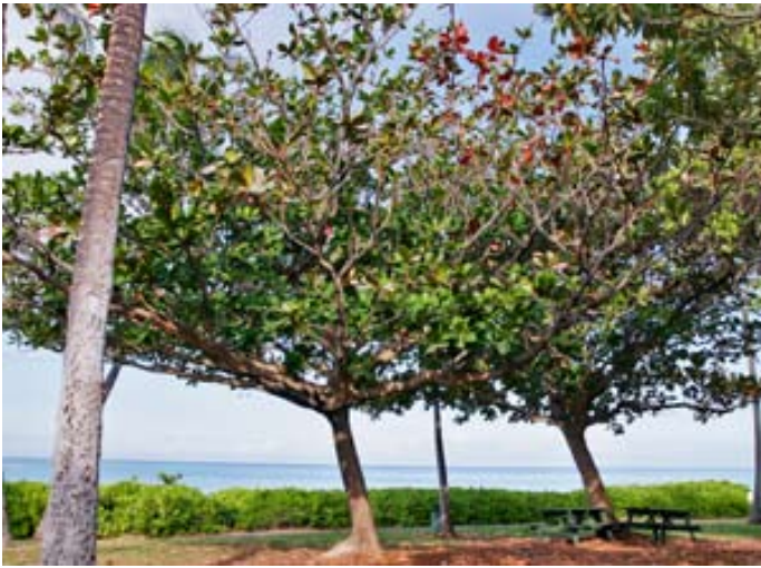
Top left: Close-up of flowers and buds. PHOTO: L. THOMSON Right: Fruits on tree. PHOTO: C. ELEVITCH Bottom left: Horizontal branching of young trees. PHOTO: C. ELEVITCH

crooked and/or leaning. Buttresses, when present, are up to 3 m (10 ft) in height, variable, straight to curved, thick to thin, sometimes branching. Large trees may develop big, occasionally branching buttresses and often have twisted, leaning trunks.