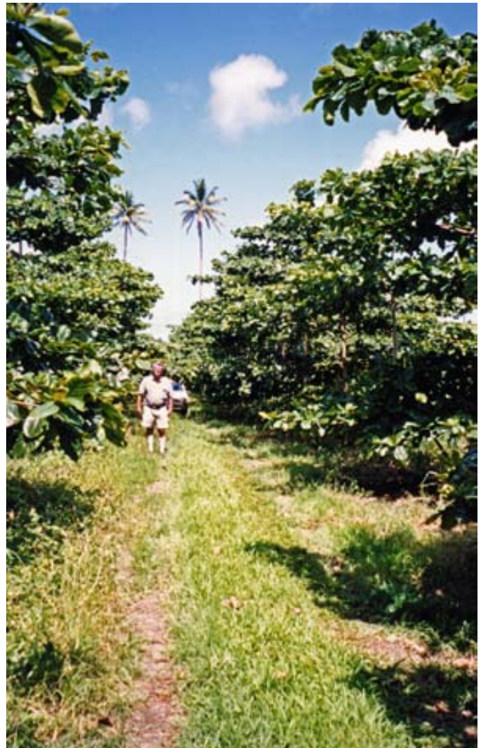
Left: Nuts skewered onto palm leaflet midribs and sold in Port Vila market, Vanuatu; pictured: author Lex Thomson. Right: The late Justin West standing among 2–3-year-old tropical almond trees he planted in a small plantation outside Port Vila, Efate, Vanuatu.

[169 stems/ac]). The final density for sawlog production is about 150–200 stems/ha (61–81 stems/ac). A suitable area for commercial production would be 10 (or more) hectares (25+ ac), but even small woodlot areas of about 1 ha (2.5 ac) could be grown on a commercial basis by groups of smallholders to supply local saw mills.