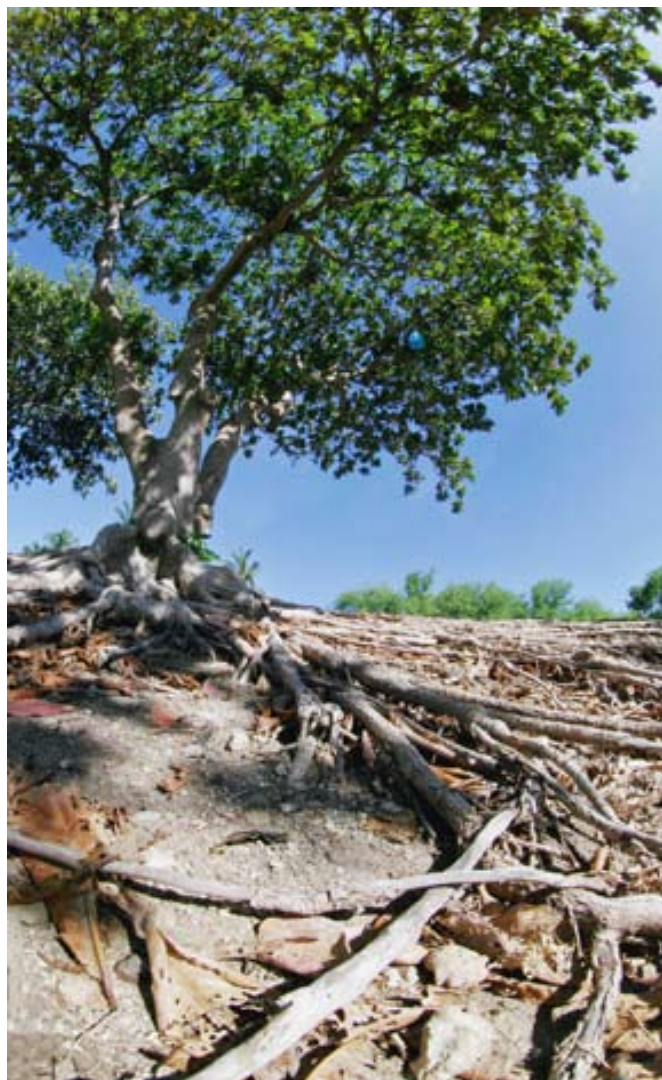
Top: Buttress of large tree, Hilo, Hawai‘i. Bottom: The extensive surface root system is exposed on this sandy, coastal slope.