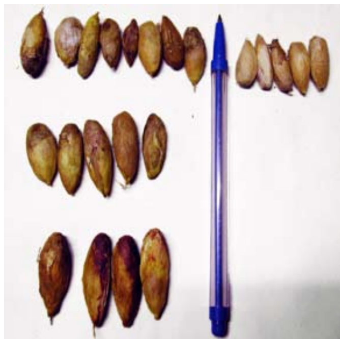
Kernels from three selected nut morphotypes of tropical almond (left) compared with wild type (right) in Vanuatu.

Tropical almond is a characteristic species of tropical beach forests, especially raised sandy beaches above high tide. It is also found along rocky shores, and sometimes on the