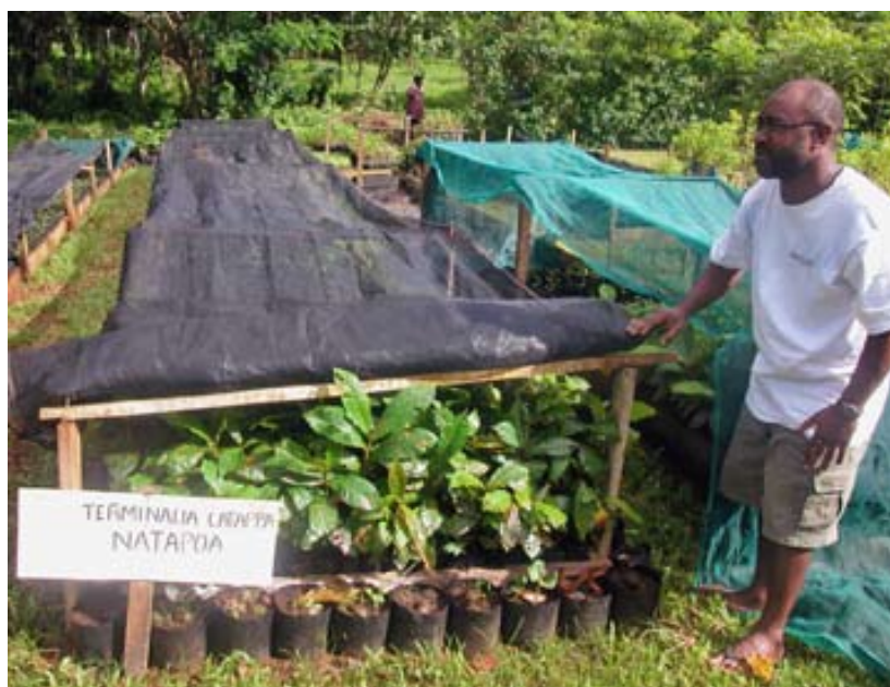
Propagation of seedlings of better nut morphotypes for distribution to farmers, Santo, Vanuatu.

The species has no major drawbacks. The tree is already naturally very widespread in the Asia-Pacific region and has multiple uses, including providing important environmental services such as coastal protection. The nuts are often not utilized or highly regarded as food because of the small size of the kernels and the difficulty of extracting them, but use of selected genetic material can greatly improve the utility of tropical almond nuts as human food.