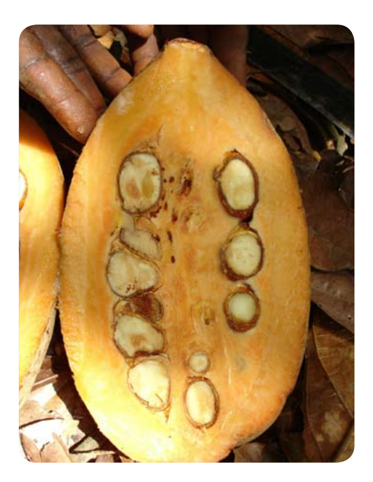
■ The heart of the matter – Allanblackia seeds embedded in yellow pulp.

Allanblackia. Among other things, the guidelines suggest that organisations and individuals involved in harvesting should encourage the regeneration of Allanblackia, refrain from felling Allanblackia trees and respect existing wildlife legislation. When it comes to domestication, the Novella Project believes that every effort should be made to resist the establishment of large-scale monocultures.