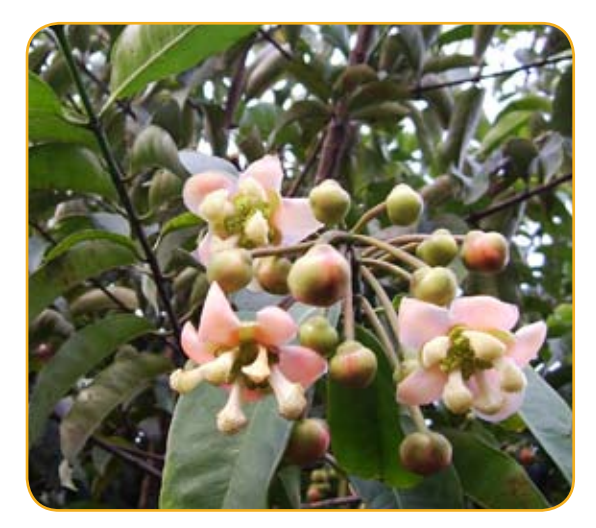
▲ A male Allanblackia tree in flower.

An individual tree can produce up to 300 fruits a year, with the average bearing 100–150 in a good season,