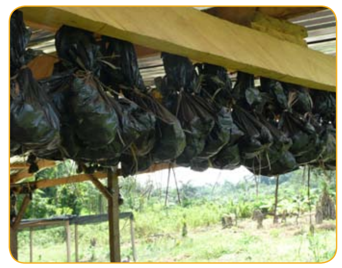
▲ Storing seeds in black plastic bags encourages quicker germination.

These two methods of encouraging germination – seed-coat removal and storage in black bags – were now adopted at FORIG with good results, and in many Allanblackia nurseries you will see black bags of seeds hung from branches and roof joists like rows of hibernating bats. The project is now getting seeds to germinate from four weeks onwards.