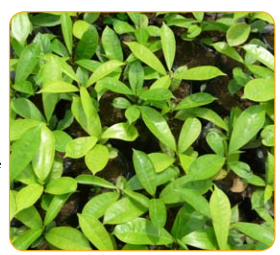
A Years of research have gone into establishing the best means of propagating Allanblackia. These seedlings will be used as rootstock for grafting.

After the World Agroforestry Centre joined the project, research in Ghana and Tanzania initially focused on working out how to get Allanblackia seeds to germinate swiftly. Some experiments were outright failures. For example, when growth hormones were applies to break seed dormancy, a commonly used practice, the entire batch of 80,000 seeds died. However, a process of trial and error, assisted by the knowledge of local farmers, eventually began to bear fruit.