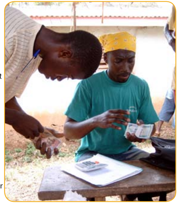
▲There are no problems with late payment. Allanblackia harvesters in Ghana get cash on delivery.

"There simply weren't a million trees available with fruit to harvest," explains Rutatina. Half of those identified in the inventory were probably male; and of those which were female not all would have been good fruiting trees. The Novella Project also failed to take into account the issue of density. "The greater the distance between trees, the less incentive there'd be for harvesters to collect their fruit," explains Hendrickx. Many of the trees that appeared in the inventories were therefore of no commercial interest.