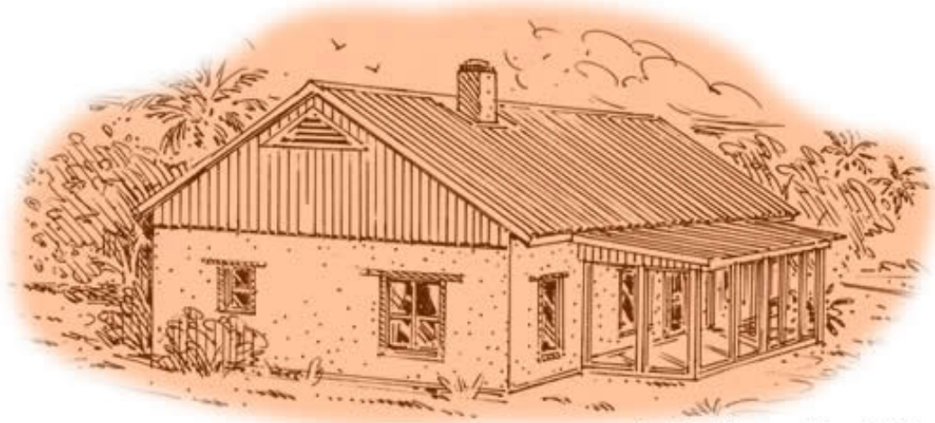
Adobe House Plan 1248