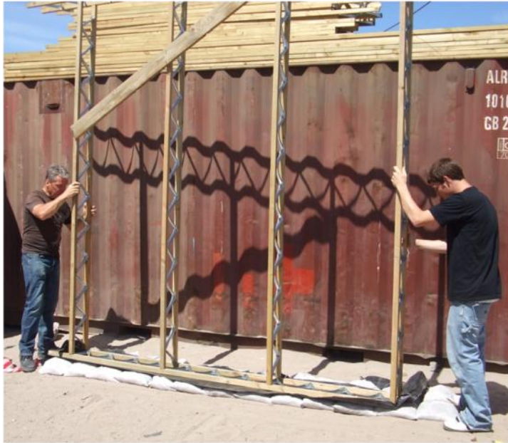
Stand frame on foundation.