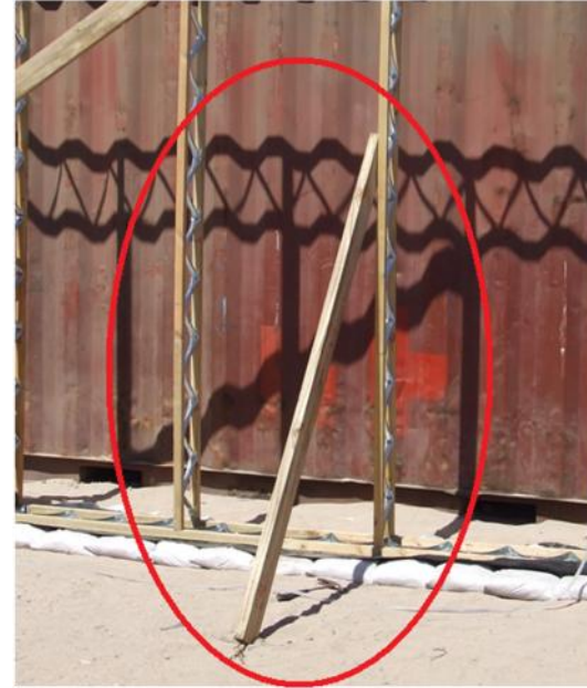
Nail a board to frame to keep frame from falling over.