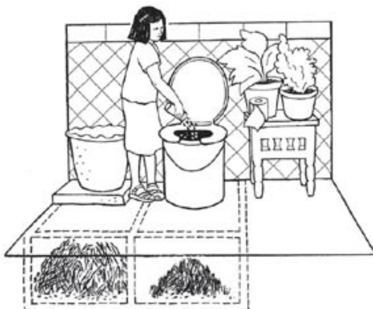
Figure 1. Double-vault urine-diverting dry ecotoilet in use in China, Vietnam, Mexico and India

environment. Drying materials, like wood ash, lime and soil, are added to cover the fresh excreta. Ash and lime increase pH which acts as an additional toxic factor to pathogens if the pH can be raised to over 9.5. The less moisture the better, and in most climates it is better to divert the urine and treat it separately. Figure 1 shows a dry, double-vault urine-diversion toilet, a model being used in China, India, Vietnam and Mexico. It takes an average family 6 months to fill one of the vaults. Then the second vault is used. The first vault is emptied following an additional 6 months of sanitization and the material is taken to a soil compost. Urine is never mixed in this toilet but continuously diverted into a separate container and later used in diluted form as plant fertilizer. The dry ecotoilet meets all necessary health and environmental protection criteria and goes well beyond what conventional approaches can offer (Stenström, 2002; Schönning and Stenström, 2004), saving water and preventing water pollution. It produces no smell, does not attract flies and is an affordable solution inside and outside of dwellings throughout the world.