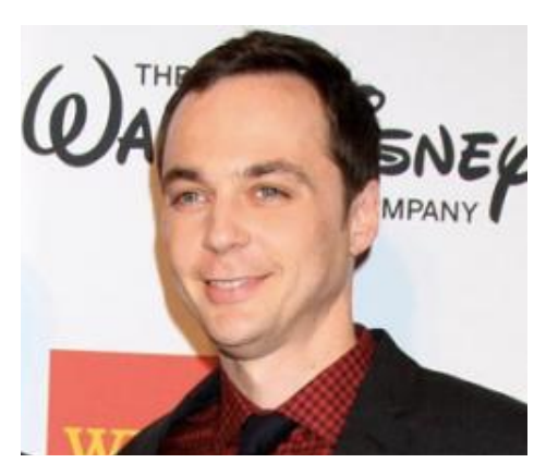
17 Gay Actors Who Rock at Playing Straight Characters?