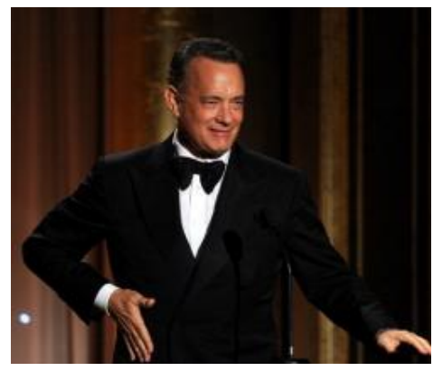
Top 10 Films Starring Legend Tom Hanks