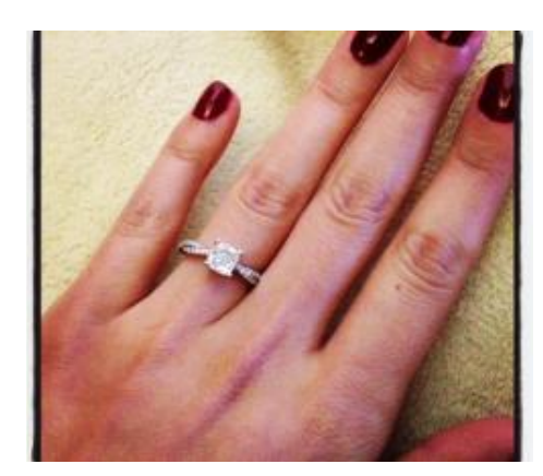
A Guy's Engagement Ring Buying Guide