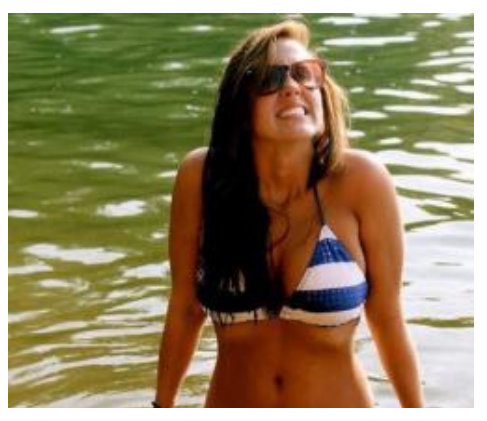
Best Pick Up Lines of All Time