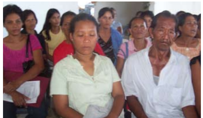
PRO-LIFE. 4 P's beneficiaries of municipality of Concepcion.

This test considers the ownership of assets, type of housing, education of the household head, livelihood of the family and access to water and sanitation facilities.