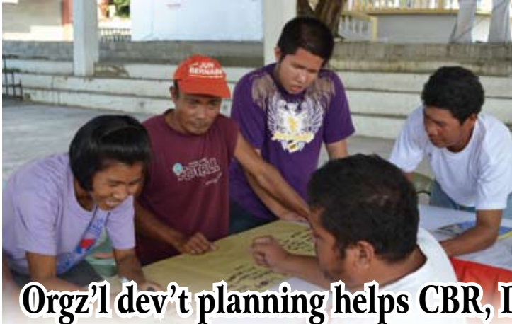
BRAINSTORM. DPO team of Barbaza discuss their programs, projects and activities during the organizational planning workshop.