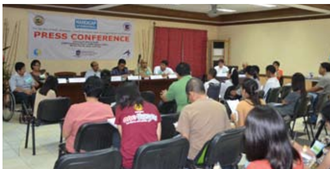
Various media entities participated during the Human Rights Press Conference last February 23, 2011.

The said affair was a follow-up activity of the Human Rights Press Conference which was held at the DSWD Conference Room last February 23, 2011 that also aimed to address the issue of accessibility and the rights and privileges of every PWD.