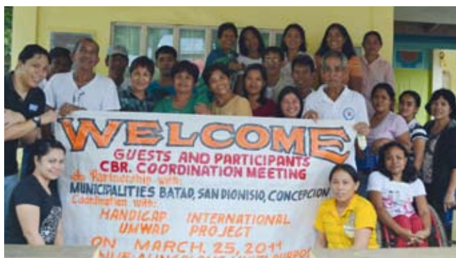
INCLUSIVE MEETING. Participants during the second Coordination Meeting held at Brgy. Alinsolong, Batad, Iloilo