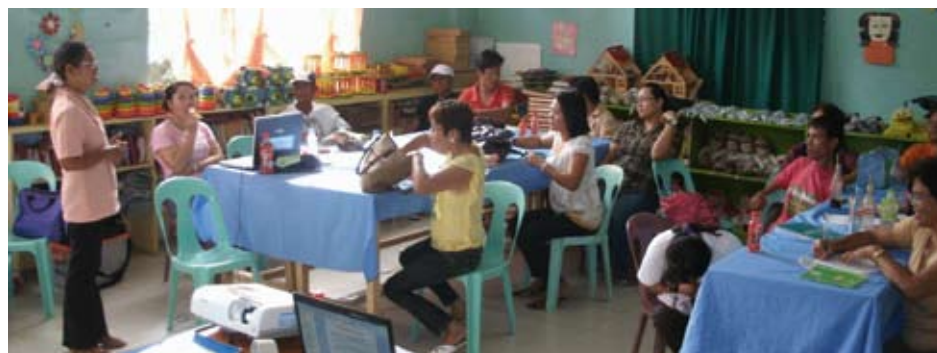
CATALYST OF CHANGE. Participants from municipality of Batad, Concepcion and San Dionisio during the conduct of coordination meeting held at Concepcion, Iloilo.

The coordination meeting is held every three months in the provinces of Iloilo and Antique.