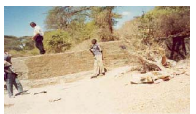
Figure 3: Sectional view of sand dam