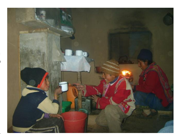
Figure 5: Bio-sand filters are easy to use.

Bio-sand filters require daily fillings during the 2 to 3 weeks when the biological layer is growing. Bio-sand filters also require regular cleaning, which involves agitating the water above the biological layer. The filter will require 1 to 2 weeks of non-use after agitation to allow for the regrowth of the biological laver. On occasion, the sand in the filter needs to be cleaned as well. There are several different methods to clean the sand, though all of them require significant labour, significant training, or high cost. User error has also been found to affect the filter's efficacy, especially because of the required 2 to 3 week nonuse period for growing the biological layer. The users of the filter must have a maintenance guide (for example, a plasticized leaf). This guide can be adhered to the filter or it is possible to be placed on the wall near the filter.