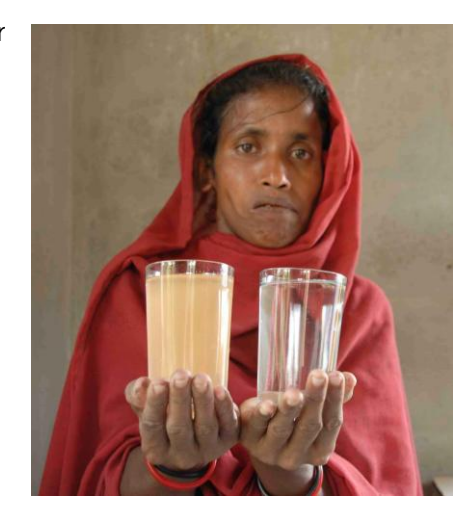
Figure 6: The improvement in water quality can be dramatic.

After mixing the water with the iron for a few minutes, the iron will be oxidized to form ferric hydroxide that passes through the sand bed by gravity removing the precipitates; clean water is collected from the outlet of the filter in the conventional way.