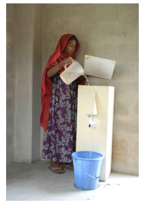
Figure 1: Domestic bio-sand filer used in Bangladesh.

The bio-sand filter's simple technology, its proven effectiveness and availability of production materials are what make it a viable option for remote households. In areas where education is limited, people of all ages, including young children, are able to use the filter and understand how it works.