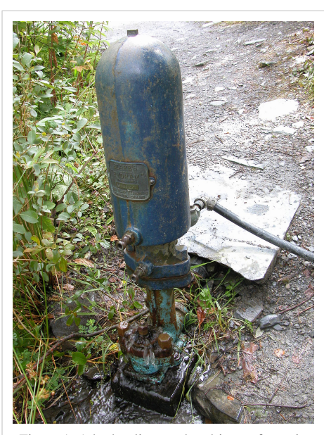
Figure 1: A hydraulic ram that drives a fountain at the Centre for Alternative Technology

A hydraulic ram, or hydram, is a cyclic water pump powered by hydropower. It takes in water at one "hydraulic head" (pressure) and flow rate, and outputs water at a higher hydraulic head and lower flow rate. The device uses the water hammer effect to develop pressure that allows a portion of the input water that powers the pump to be lifted to a point higher than where the water originally started. The hydraulic ram is sometimes used in remote areas, where there is both a source of low-head hydropower and a need for pumping water to a destination higher in elevation than the source. In this situation, the ram is often useful, since it requires no outside source of power other than the kinetic energy of flowing water.