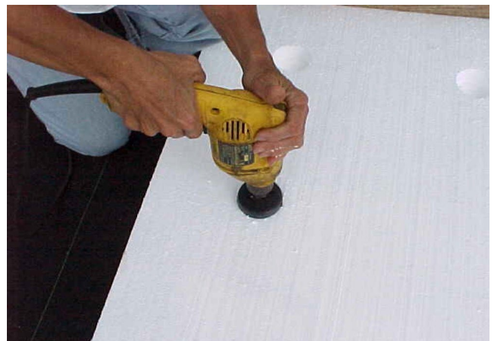
Figure 4. Drilling holes in styrofoam for transplants.