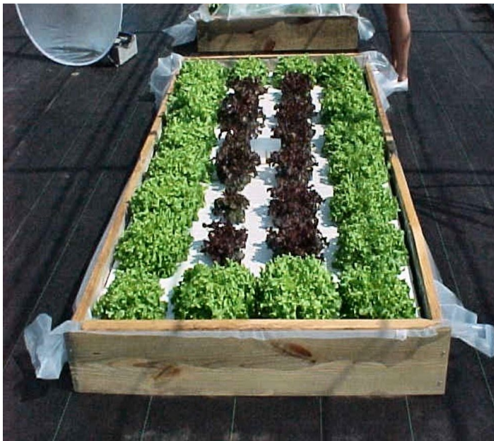
Figure 1. Lettuce in floating garden system.

The Aztecs amazed the Spanish conquistadors with their floating gardens, and now 500 years later you can impress your friends and neighbors with yours. A floating hydroponic garden is easy to build and can provide a tremendous amount of nutritious vegetables for home use, and best of all, hydroponic systems avoid many pest problems commonly associated with the soil. This simple guide will show you how to build your own floating hydroponic garden using material locally available at a cost of about $50.00 (Figure 1).