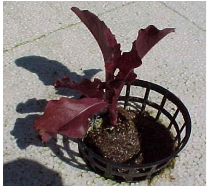
Figure 3. Lettuce transplant in net pot.