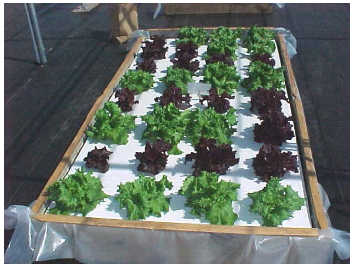
Figure 6. Healthy lettuce being grown in a standard 4x8 ft floating garden.

Several leafy salad crops such as lettuce (romaine, Boston, bibb, & leafy lettuces, Figure 6), mustard greens, mizuna, mint, chives, and kale grow well during the cool season. There are fewer crop options for the warm season, however, basil, Swiss chard, cucumber, watercress, and some cut-flowers, like Zinnia and sunflowers have done well. Growing with floating systems does not override the normal challenges of gardening in the warm season in Florida.