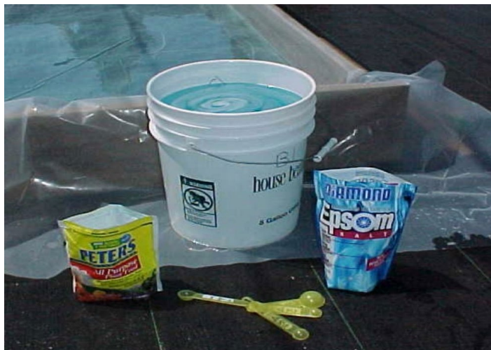
Figure 2. Nutrients needed for floating garden.