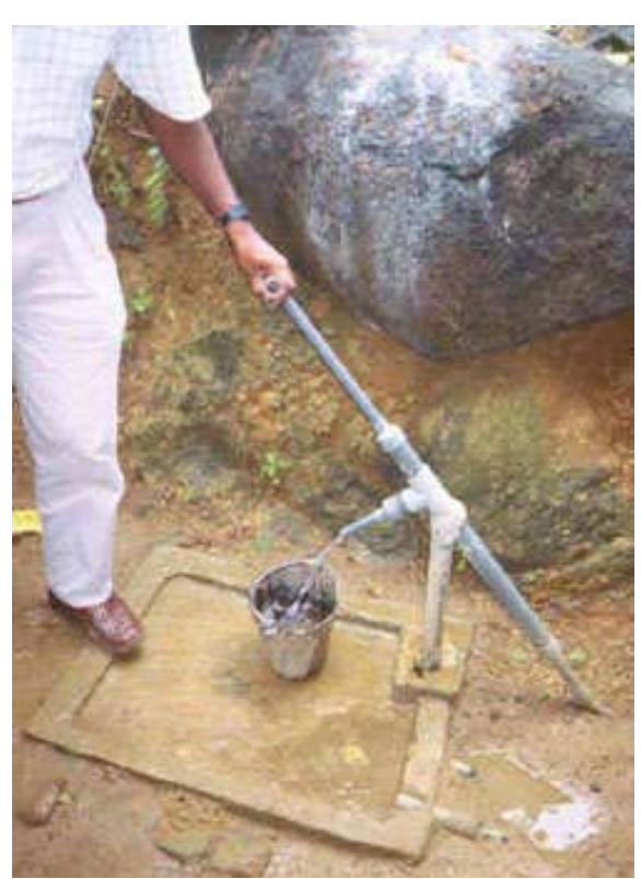
Figure 2: The Tamana pump installed at Batalahena Sri Lanka