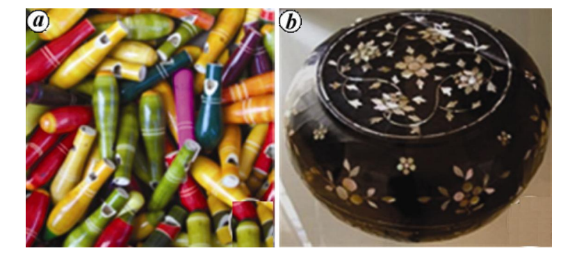
Figure 1. a , Lacquer-finished wooden whistles made in Chennapatna, Karnataka, contemporary India. b , Lacquer container inlaid with peony décor (mother-of-pearl), Ming Dynasty, 16th century (<u>http://en.wikipedia.org/wiki/Lacquer</u>).