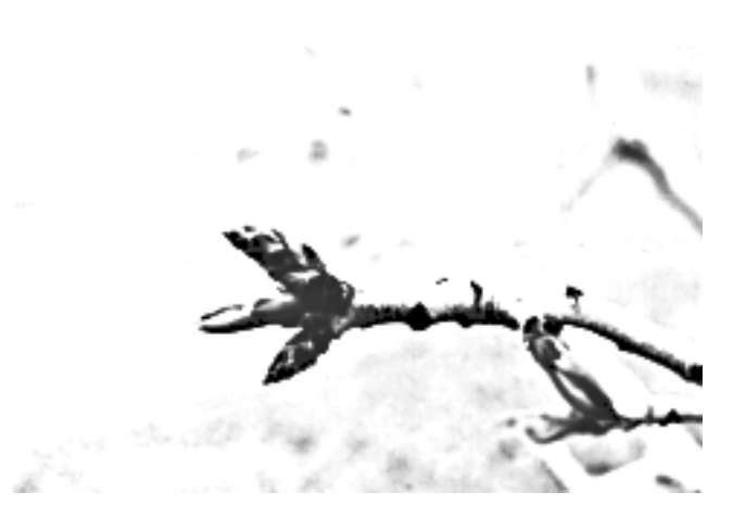
Fig. 7. Flower from 'Kerman' (female) variety.