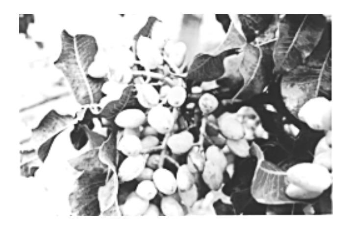
Fig. 9. Pistachio nuts before harvest.