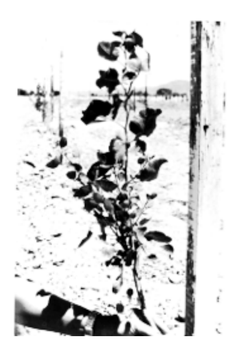
Fig. 3. Young 'Kerman' tree.