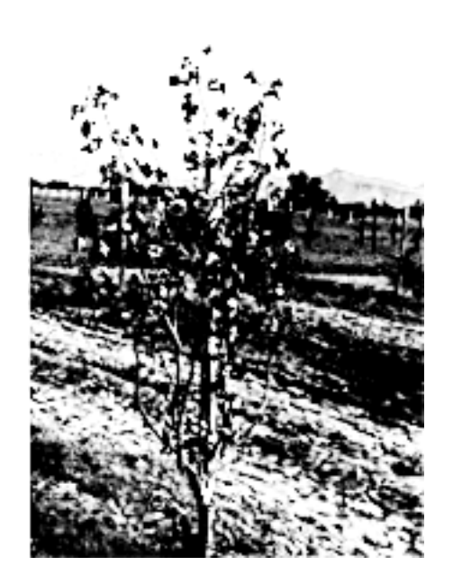
Fig. 4. Dead pistachio tree due to cotton root rot. (Dead leaves do not fall from the tree.)