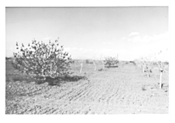
Fig. 5. Pistachio orchard, 'Peters' variety in the left row, 'Kerman' in the right row.