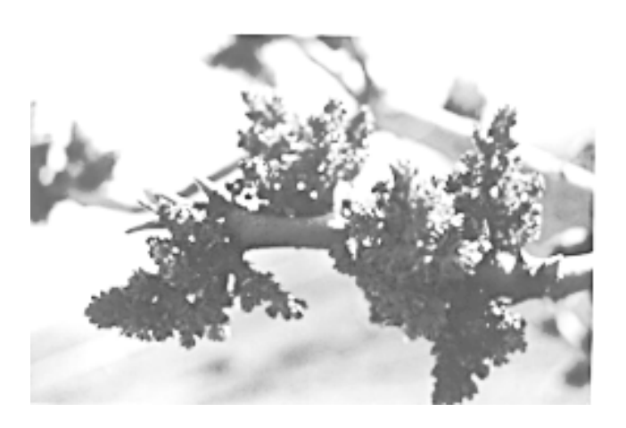
Fig. 6. Flower from 'Peters' (male) variety.