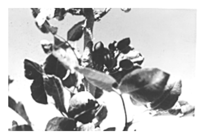
Fig. 8. Pistachio nuts during the season.