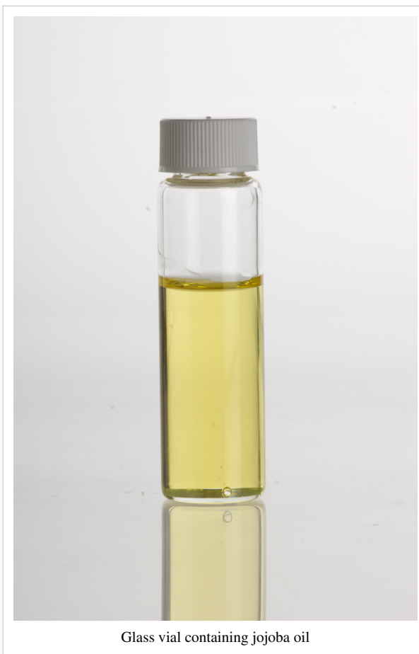
Glass vial containing jojoba oil

Unrefined jojoba oil appears as a clear golden liquid at room temperature with a slightly nutty odor. Refined jojoba oil is colorless and odorless. The melting point of jojoba oil is approximately 10°C and the iodine value is approximately 80. Jojoba oil is relatively shelf-stable when compared with other vegetable oils mainly because it does not contain triglycerides, unlike most other vegetable oils such as grape seed oil and coconut oil. [1] It has an oxidative stability index of approximately 60, which means that it is more shelf-stable than safflower oil, canola oil, almond oil or squalene but less than castor oil and coconut oil.