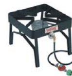
Cat No 16315