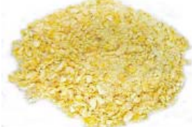
Cat No 13110