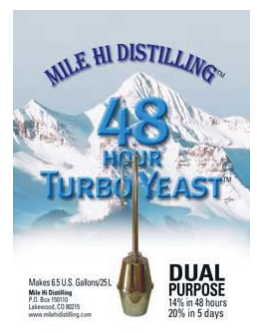
Cat No 83321MHD