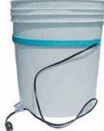
Cat No 86830