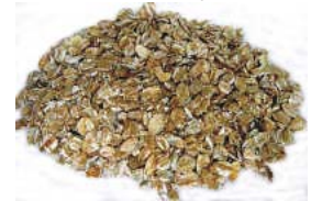
Cat No 13125