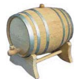
17015 2 L (0.52 gallon)