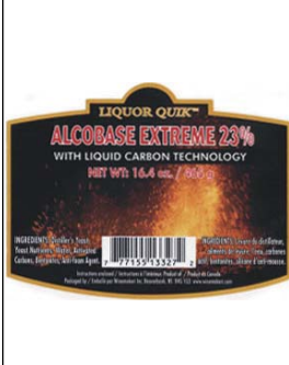
Cat No 83327