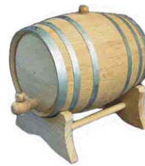
17025 5L (1.31 gallon)