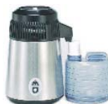
Cat No 16050