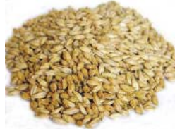
Cat No 13120