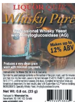
Cat No 83310