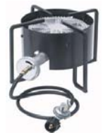
Cat No 16310