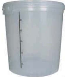
Cat No 86201