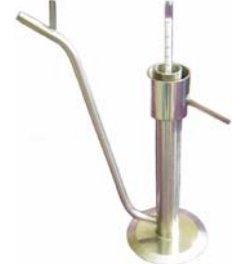
Cat No 86110