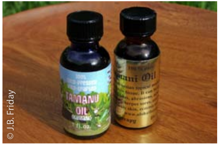
Bottles of tamanu (or kamani) oil for sale in Hawai'i.

The value of tamanu oil lies not just in its physical and healing properties, but with the connection consumers make with the Pacific islands. For Western users, it allows an escape from the daily routine and the chance to try something exotic. For consumers in Hawai'i or Polynesia, using tamanu oil allows them to connect with a cultural tradition. Tamanu oil is seen as a treat or an indulgence rather than something for everyday use. As currently sold, the oil is packaged in very small bottles, usually only 30 ml (1 oz) and seldom more than 60 ml (2 oz) with labels evoking Hawai'i or the South Pacific. For the Hawai'i market (or for marketing to those who have visited Hawai'i) the oil is labeled "kamani oil" using the Hawaiian name but for the rest of the world it is more commonly labeled "tamanu oil" using the Tahitian name. Although the oil is now also sourced from Madagascar, the marketing emphasizes the connection with Tahiti or Hawai'i rather than Africa. Value is added to the product not so much by processing as by packaging and marketing. Some oil is marketed as being USDA certified organic, although it is unlikely that pesticides or chemical fertilizers are used to any great extent for tamanu. Tamanu wood is likewise prized in Hawai'i, Tahiti, and elsewhere in