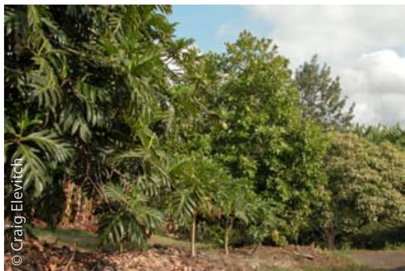
Top: Tamanu trees shade Marine Drive in Guam. Bottom: Tamanu tree (at center of photograph) grows together with breadfruit ( Artocarpus altilis ), papaya ( Carica papaya ) and kukui ( Aleurites moluccana ) at 460 m (1,500 ft) elevation in Kona, Hawai'i.