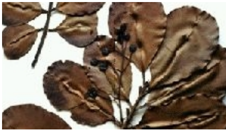
Calophyllum inophyllum leaves and fruit (Zhou Guangyi)

The bisexual flowers are pollinated by insects such as bees. The flowering and fruiting periods vary. In India, the flowers appear in May-June and sometimes again in November. It has been suggested that apomixis may occur in Calophyllum, resulting in polyembryony. Trees often bear fruit throughout the year. The fruit is dispersed by sea currents and by fruit bats. Hybridization may occur with C. inophyllum as one of the parents.