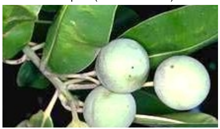
Leaves at Kalepolepo Kihei Maui, Hawaii