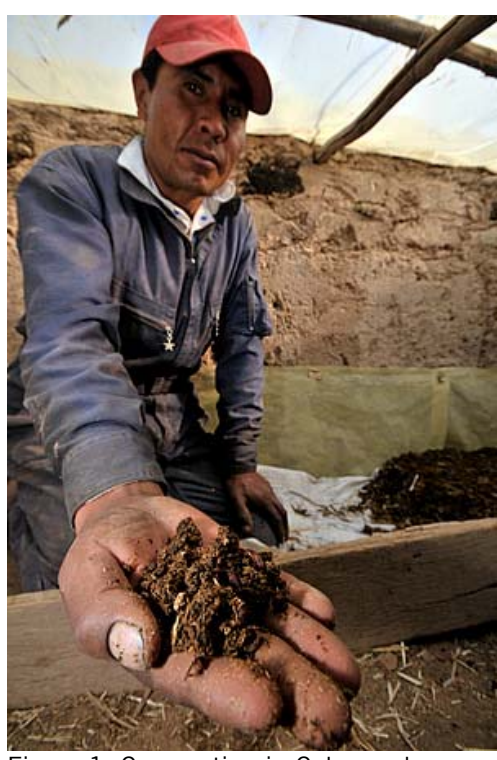
Figure 1: Composting in Colquencha, Bolivia.

This brief would be useful for anyone facing the challenge of managing organic waste. It is particularly intended for project engineers, planners or managers in municipalities, NGOs and businesses.