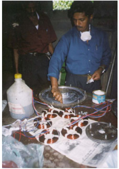
Figure 5 : making a PMG in Sri Lanka.