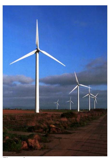
Figure 1 : Wind turbines are getting bigger and wind farms are more common. Great Orton Windcluster.

To a lesser degree, there has been a parallel development in small-scale wind generators for supplying electricity for battery charging, for stand-alone applications and for connection to small grids. Table 1 shows the classification system for wind turbines: