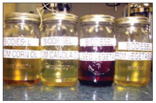
Figure 1. Biodiesel samples from different plant oils

Biodiesel could also be produced from waste vegetable oil from restaurants, chip shops or industrial food producers. Waste vegetable oil can often be acquired unrefined for free or already treated for a small price.