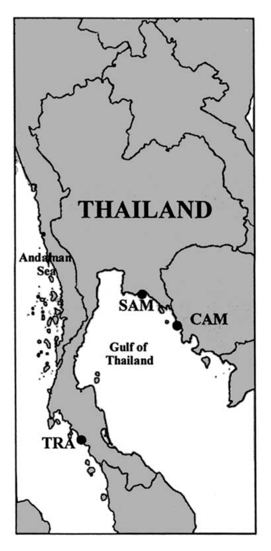
Figure 1. Map of Thailand indicating sampling sites of H. asinina used in this study. Dots represent sample locations (except the Philippines sample) from which H. asinina was collected. CAM indicates Cambodia; SAM, Samet Island; TRA, Trang.

Specimens of H. asinina were collected from 6 samples (Figure 1). Natural abalone include samples from Talibong Island (HATRAW, N = 28) located in the west of peninsular Thailand, and Samet Island (HASAME, N = 12) and Cam-