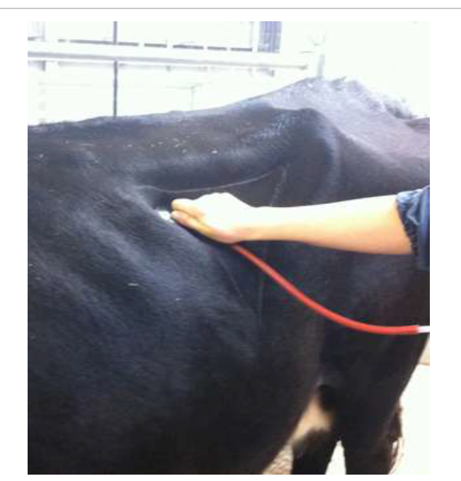
Figure 4: Auscultation of rumen contraction.