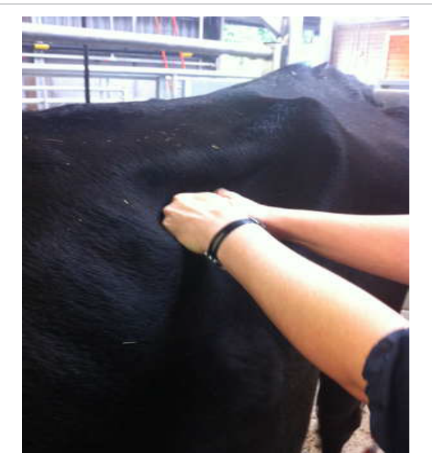
Figure 3: Feeling rumen contraction by palpation.

• Rectal examination of the internal abdominal structures: cut and smooth the nail; wear shoulder long glove; lubricate; cone shape of the fingers; insert in rotating way; notice: the hand cannot open, or even grasp organs inside. It's necessary or possible to use tranquilizer to reduce the sensitivity of the rectum in horse. In bloat case, the pressure in the abdomen would be very high, so it would be difficult to insert the hand inside (Figure 5).