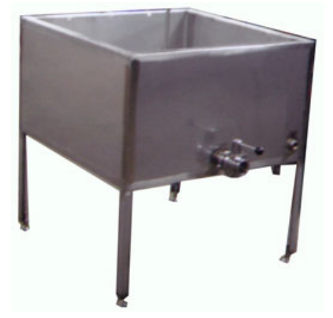
Figure 1: Cheese vat.