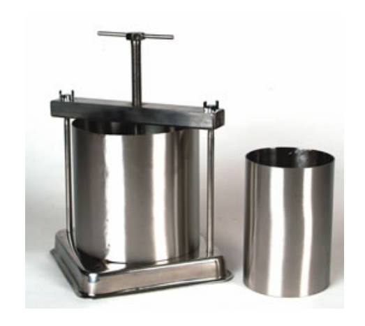
Figure 4: Cheese press