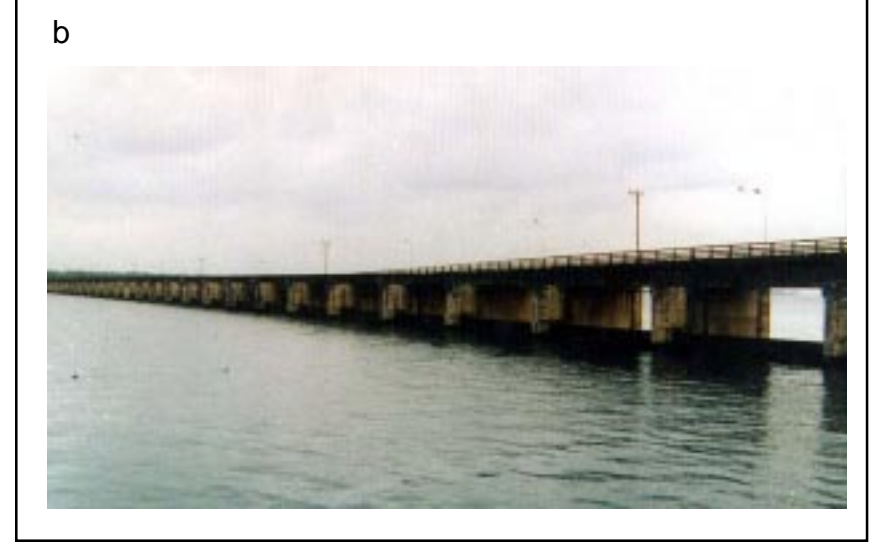
Figs. 2a and 2b. Thanneermukkam salinity barrier.

years. They formed 17% of the catch in 1994-1995 and only 2% in 1995-1996. For females, the dominance of the weight group 100-150 g was very apparent and formed 44% and 43% of the catch, respectively, in the two years.