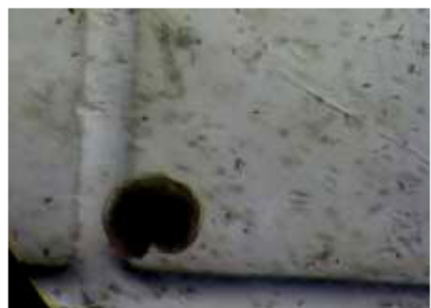
Figure 6 Cyclocypris .

Temperature is one of the most outstanding and biologically significant phenomena of aquatic environment; it has the relationship on zooplankton variation. In pond,