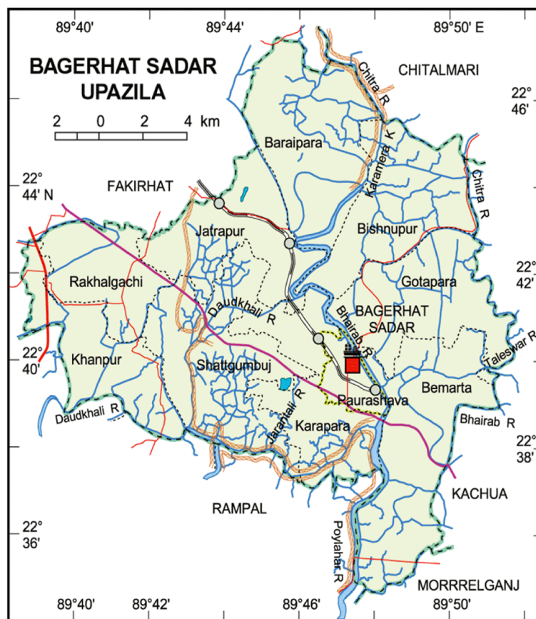
Figure 1 Map of Bagerhat sadar.

A semi-intensive prawn farm was selected for the present study which was situated beside the Bagerhat town in Bagerhat district and geographically located at 22°36' to 22°46' north latitude and 89°40' to 89°50' east