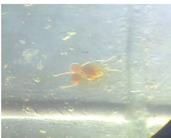
Figure 4 Filinia .

During the present study a total of 11 genera of different group of zooplankton were identified from the study farm. The maximum amount of zooplankton was found at the