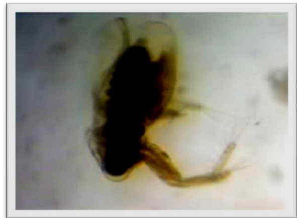
Figure 7 Diphansoma .

the range of water temperature was found 22°C to 30°C. The maximum temperature was 30°C in August and minimum in December (22°C). The highest temperature during summer months was reported by Das and Bhuyan (1974), Islam et al. (1974) in Bangladesh. The low temperature was found in winter was supported by Das and Bhuyan (1974). The rainfall and air temperature has the direct influences on the variation of water temperature (Michael, 1968). Zooplankton abundance showed poorly positive correlation with water temperature in semi-intensive culture. In the pond Rotifera ( r = -.805 ), Copepoda ( r = +.668 ), Cladocera ( r = -.096 ), Ostracoda ( r = -.320 ), and such finding resembles the works of Chowdhury et al. (1987), Patra and Azadi (1987) and Islam et al. (2000). Ostracoda, crustacean larvae shows highly significant with water temperature.