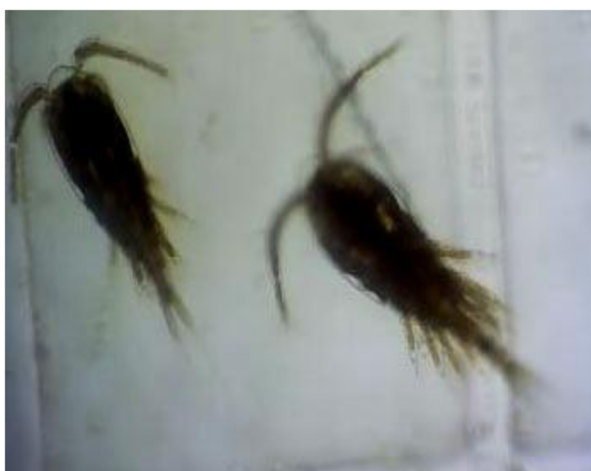
Figure 8 Mesocyclops .

Fluctuation of the limit of visibility is inversely related with turbidity. Transparency depends on zooplankton abundance and other organic particles. The range of transparency was 18 cm to 26 cm at the study period. The