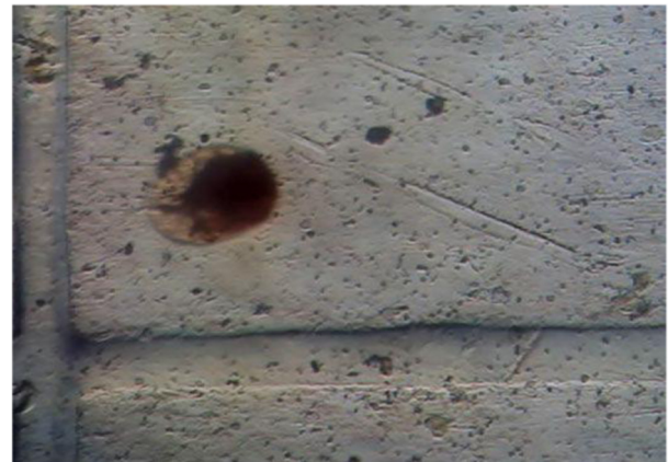
Figure 5 Cypris .

month of October (20%) and minimum (14%) amount was found at the month of November. So, the maximum amount was found at the last summer season and minimum at early winter season. The zooplankton showed its peak in last summer. Such single peak was recorded by Miah et al. (1993) from a fish pond at Mymensingh. George (1964) observed maximum population of zooplankton in November, January and April to September and the major pulse was in June with 1399 units/L was observed. Patra and Azadi (1987) also found the peak in early winter from the Halda River in Bangladesh. But in the prawn farm which was semi-intensive maximum zooplankton was found at summer season because the farmers used artificial feed at maximum amount (body weight 8%) and the flow of rain water contained higher amount of nutrient. The similar result was found Islam et al. (2008), worked into two culturable ponds at southern part of Khulna.