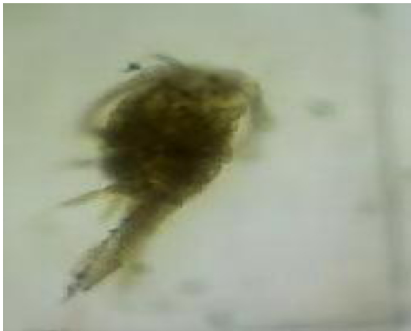
Figure 3 Brachionus sp.