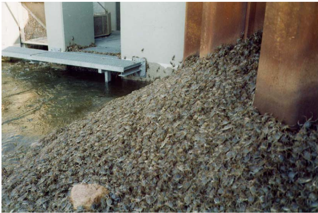
Fig. 2 . Juvenile Eriocheir sinensis crabs during mass migration in Geesthacht (near Hamburg, Germany) in 1998, photo by Stephan Gollasch, <u>www.gollaschconsulting.de</u>.