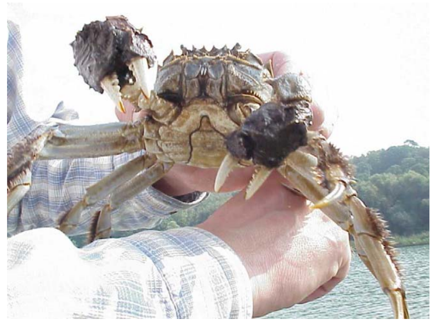
Fig. 1. Adult crab Eriocheir sinensis, photo by Stephan Gollasch, www.gollaschconsulting.de

Common names: Chinese Mitten Crab (GB), Chinese Freshwater Edible Crab (GB), Crabe Chinois (FR), Chineesche Wolhandkrab (NL), krab čínsky (CZ), Chinesische Wolhandkrabbe (DE), Kinesisk uldhåndskrabbe (DK), hiina villkäpp-krabi (EE), Kinesisk Ullhåndskrabbe (NO), Kinesisk Ullhandskrabba (SE), Villasaksirapu (FI), Krab wełnistoszczypcy (PL), Kinijos Krabas (LT), Ķīnas cimdiņkrabis (LV), Kitajskij mokhnatorukij krab (RU).