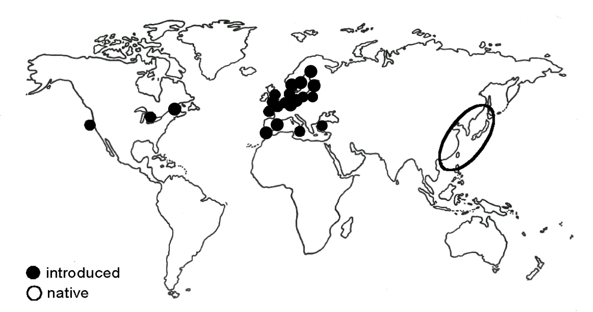
Fig. 4. World-wide distribution of Eriocheir sinensis. Drawing courtesy of Gollasch et al. 1999.

Area of origin are waters in temperate and tropical regions between Vladivostock (RU) and South-China (Peters 1933, Panning 1938), including Taiwan. Centre of occurrence is the Yellow Sea (temperate regions off North-China, see open circle on world map) (Panning 1952).