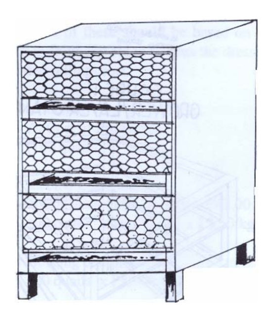
Fig. IV Battery or layer type house for quail. This type of housing, one can raise more quails even in a limited space. Sheets (i.e., G.I) should be provided in between layers for waste collection purposes.