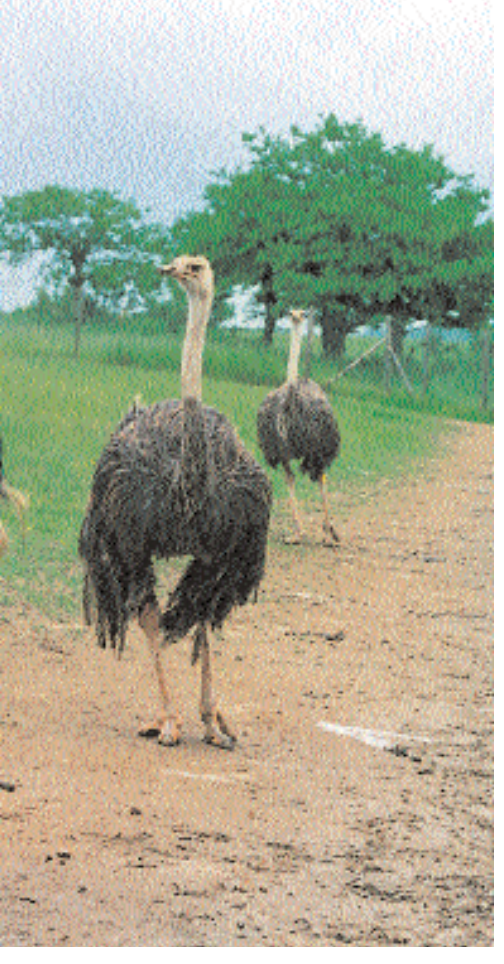
Figure 1. Ostrich farms in Zimbabwe (1997)

customer. Training of chicks to walk in flocks is an