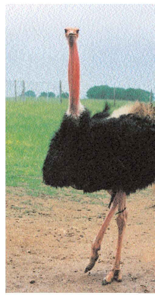
Ostrich production is a complicated business but well understood by the Zimbabwean farmers, although there are different ideas about how to keep these big birds

Sticking to one feed type is important to prevent metabolic imbalances. The scoring for this statement was more towards the strongly agreed at 38%, although it was surprising to see a relatively high disagreement of 17%. This may explain high losses in pro-