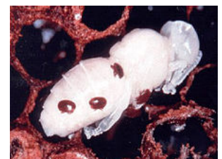
Varroa mites on pupa