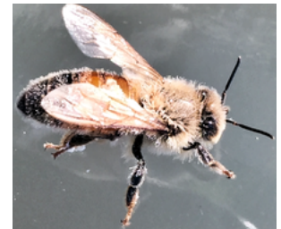
Honeybee coated with oxalic acid to protect it from mites