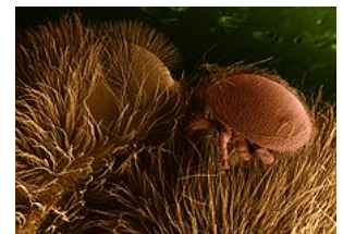
Low-temperature scanning electron micrograph of V. destructor on a honey bee host

Varroa mites have been found on tricial larvae of some wasp species, such as Vespula vulgaris , and flower-feeding insects such as the bumblebee, Bombus pennsylvanicus , the scarab beetle, Phanaeus vindex , and the flower-fly, Palpada vinetorum . [5] It parasitizes the young larvae and feeds on the internal organs of the hosts. Although the Varroa mite cannot reproduce on these insects, its presence on them may be a means by which it spreads short distances (phoresy).