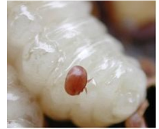
Varroa destructor on bee larva