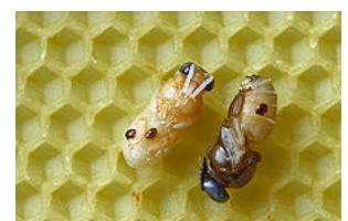
Varroa mites on pupae