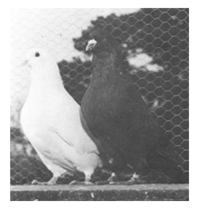
Figure 1. White King hen (on left) and Red Carneau cock (on right)

The Red Carneau , which originated in France, is the most popular of the Carneau varieties. Its features are: