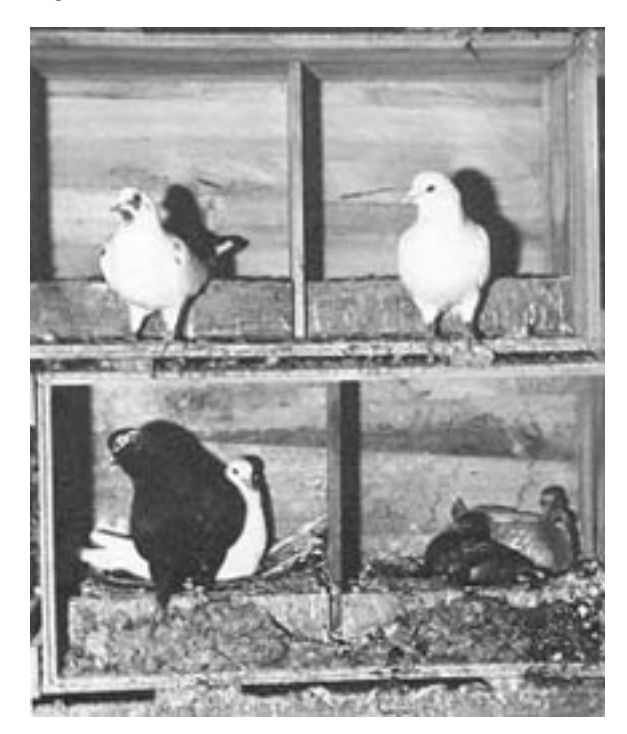
Figure 3. Double nest boxes

A double nest box for a pair of pigeons (see photo above) should be about 40 cm high and 60 cm wide, and partitioned in the centre to provide 30 cm for each nesting box. Nests should be 40 cm deep, and fitted with a 20 cm wide external platform to allow pigeons easy access to the nest.