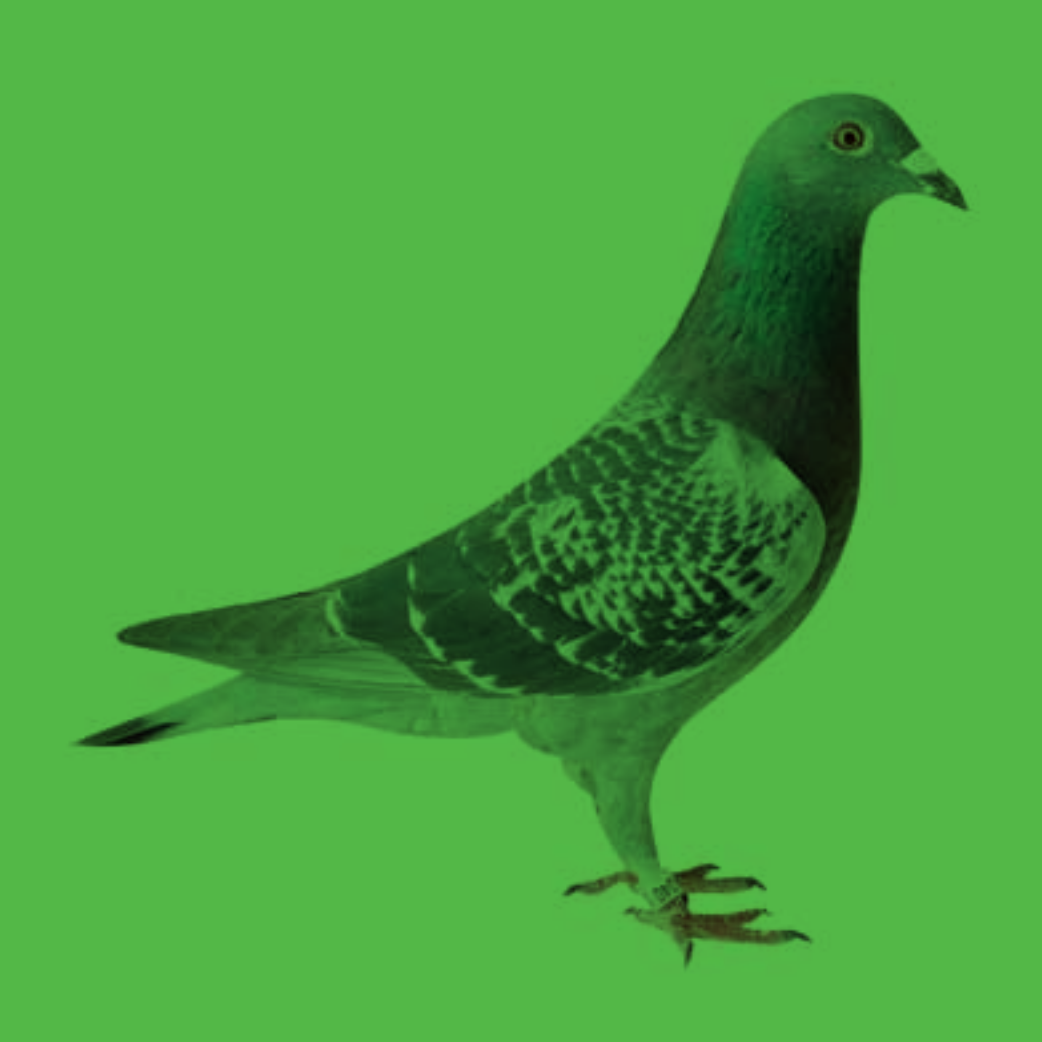
Brief description of the present basic strains at the Breeding Station