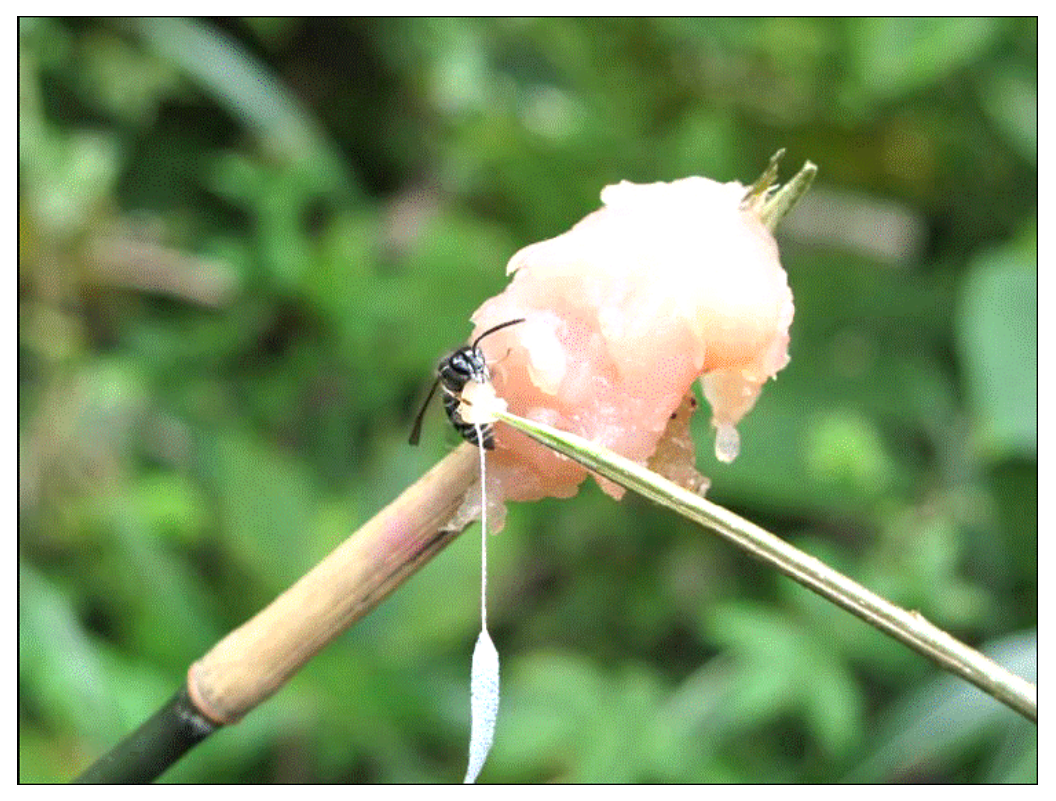
Plate 1. Vespula flaviceps starting to carry a meat ball with tiny ribbons attached back to the nest

A similar method is used for giant hornets ( Vespa mandarinia ), which are the largest wasps in Japan. A meatball with a tiny ribbon attached is not required in this case, because the worker wasps are much larger and can be tracked more easily. Protective suits, which have to be specially ordered, are essential when collecting the hornet nest during the day time, because these insects are very dangerous (Plate 2). Some people tie a tiny white ribbon around the waist of the worker wasp while it is eating the bait. Others, wary of attacks, prefer to collect wasps at night when the workers are sleeping.