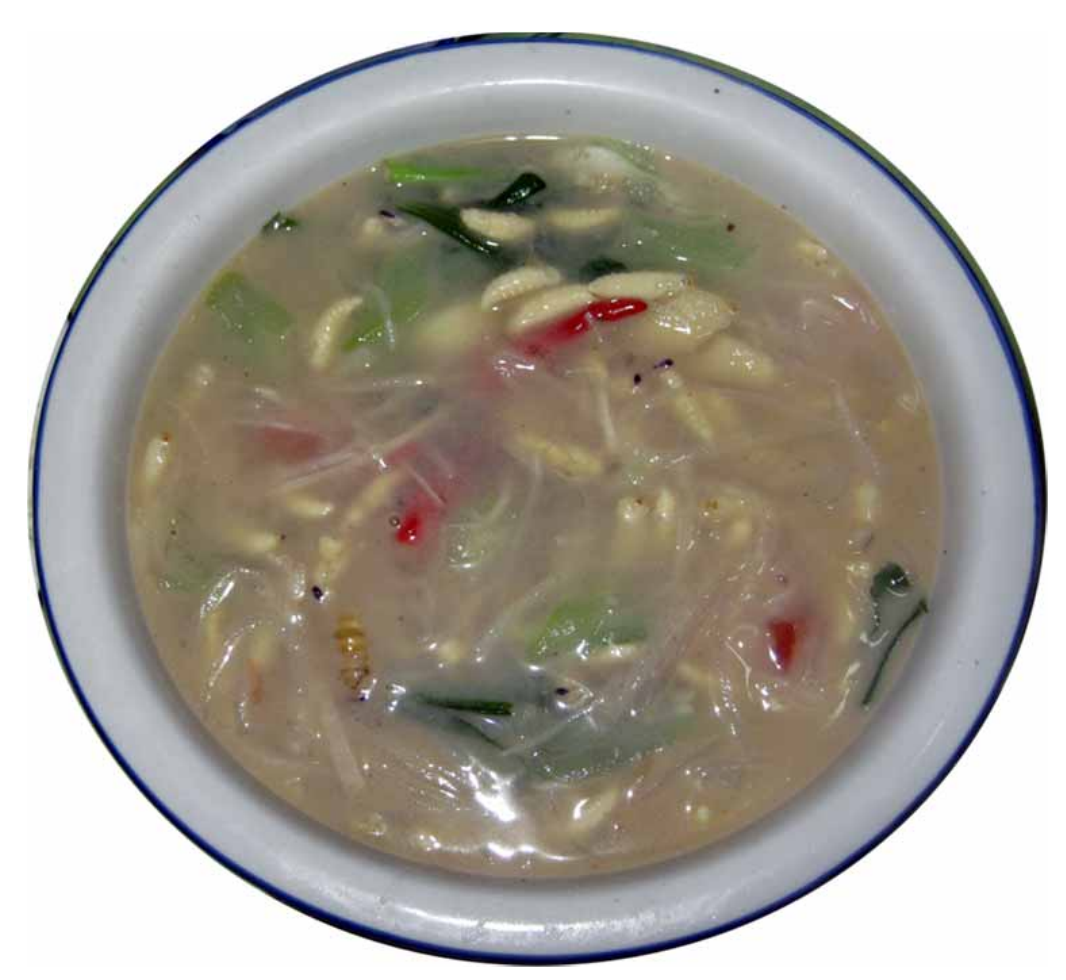
Plate 1. Wasp larvae and pupae soup (steamed larvae and pupae of wasps with bamboo shoots and vegetables), Ruili, Yunnan