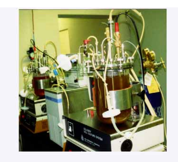
Plate 3. A model of a programmed cell culture system with glass jars