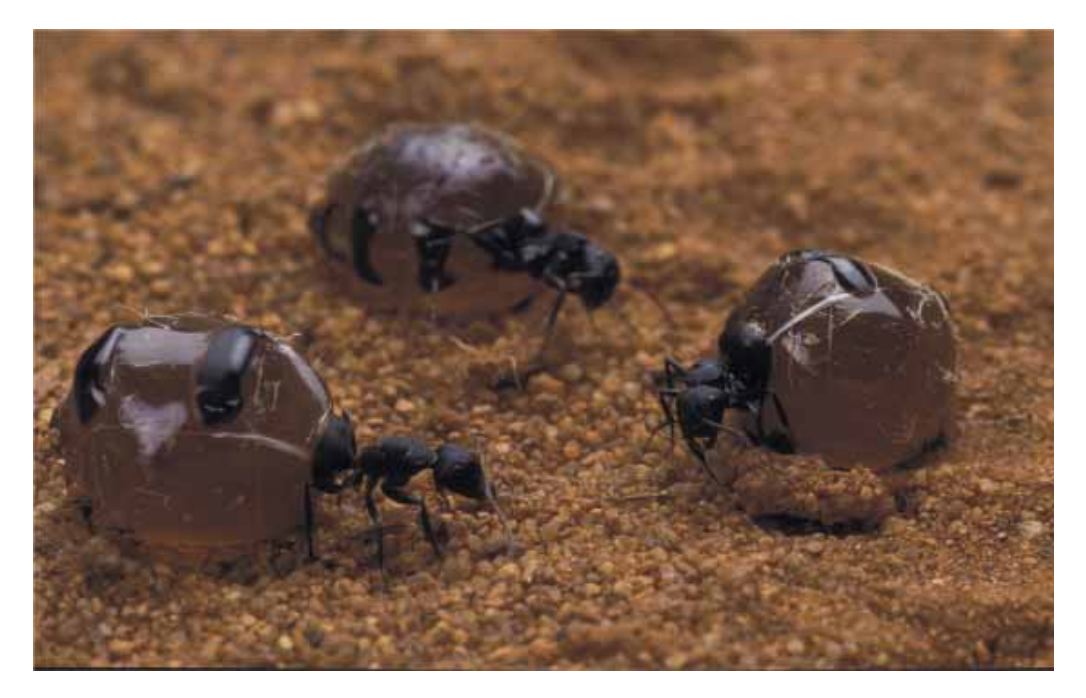
Plate 2. Honey ants

Aborigines involved patterns of movement determined by resource availability, and this, combined with low population numbers, reduced the danger of overexploitation of food resources.