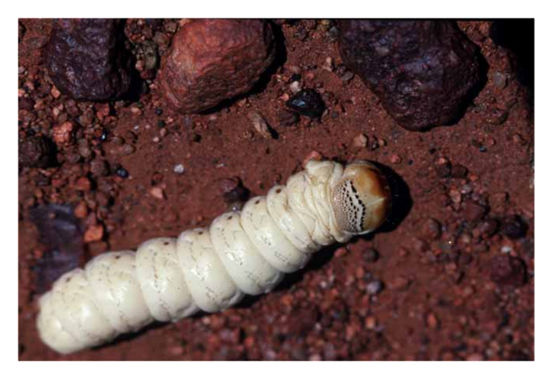
Plate 1. Witjuti grub from Central Australia

The common names of some of these insects are based on Aboriginal names. As there are 270 different Aboriginal languages with 600 to 700 dialects in Australia (Australian Info International 1989), this has led to much confusion and different spellings. For example, the name witjuti grubs (also spelled witchetty or witchety ) is derived from the Pitjantjatjara name for Acacia kempeana , but it has now been loosely applied to many edible grubs across Australia. Among the Arernte, the same species is known as tyape atnyematye , with tyape indicating edible grub, atneyeme is the witchetty bush and atnyematye is the grub from the root of the witchetty bush (Central Land Council 2007b). The name bardi grubs is based on a buprestid beetle from Xanthorrhoea in southwestern Western Australia, but has also been loosely applied to edible grubs: they used a term for edible grub , such as maku in Pitjantjatjara, followed by the name of the plant (Yen et al. 1997). Hence the edible grub from Acacia kempeana is known as maku witjuti among Pitjantjatjara speakers or tyape atnyematye by the Arrernte (Plate 1).