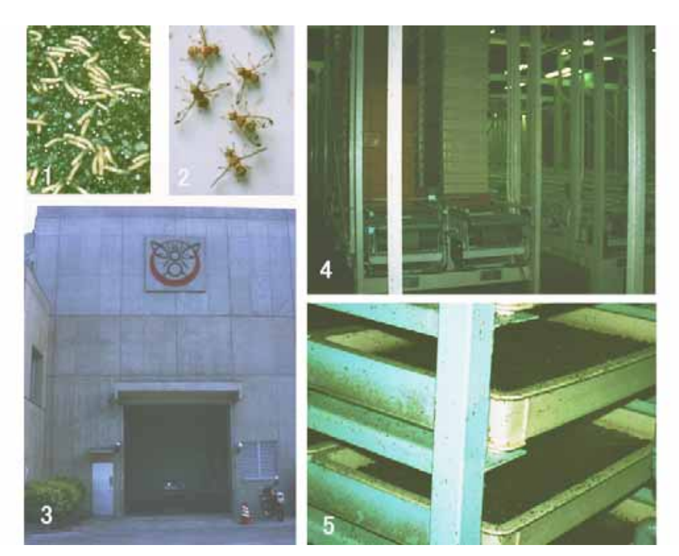
Plate 1. A plant producing sterile melon flies for their eradication: (1) larvae, (2) adults, (3) main building, (4) part of the automated rearing system, (5) feeding trays for larvae