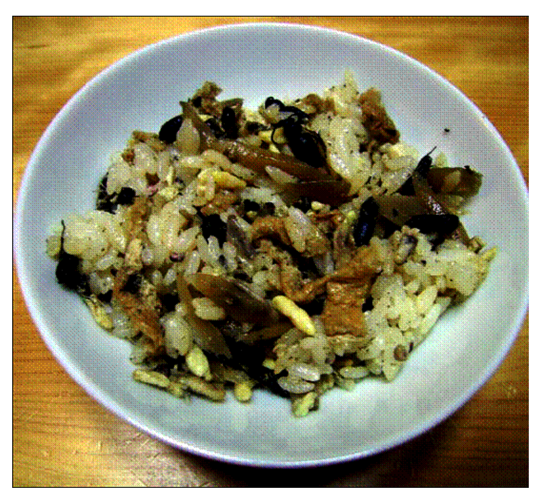
Plate 3. Mixed rice with Vespula flaviceps

A variety of dishes are prepared using species of Vespula . Wasps simply boiled with soy sauce are good with rice and also make good accompaniments for sake. Mixed rice is a popular dish. Gohei-mochi , or skewered rice cake, is made by mashing up rice and reforming it into a flat oval shape, which is then grilled with a sauce. Hebo-gohei-mochi is another kind of gohei-mochi , which is prepared using a sauce made from mashed Vespula . Various kinds of sushi are also made using Vespula . Recipes for wasp larvae dishes vary greatly from household to household, bringing a varied autumn feast to the dinner table.