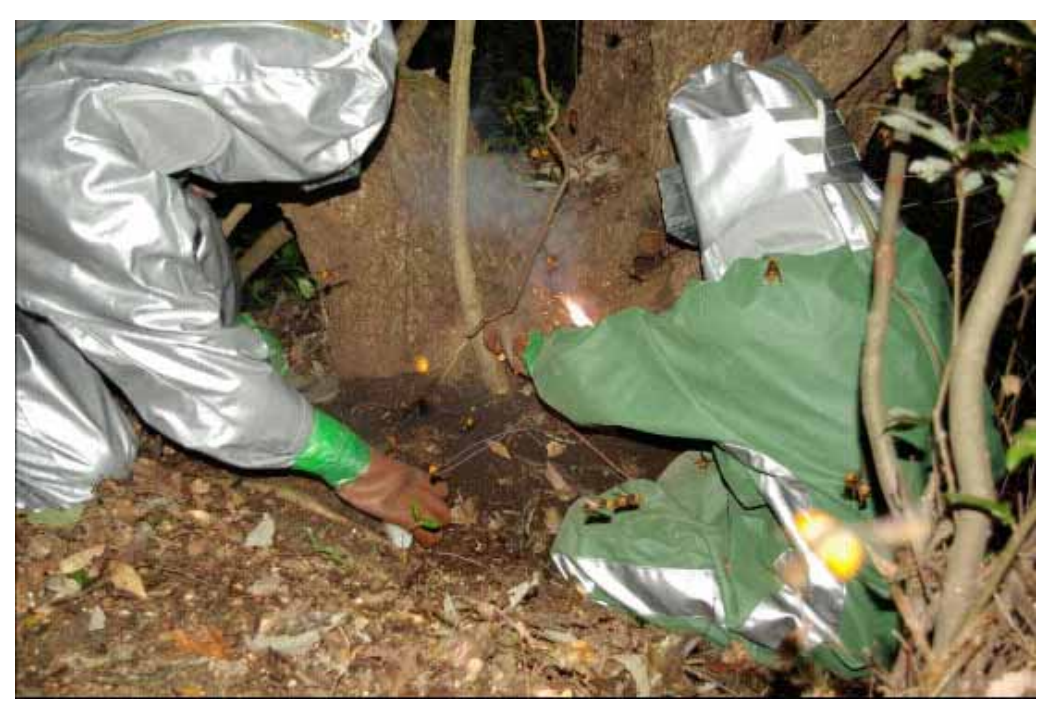
Plate 2. Collectors wearing protective suits against Vespa mandarinia approaching the nest