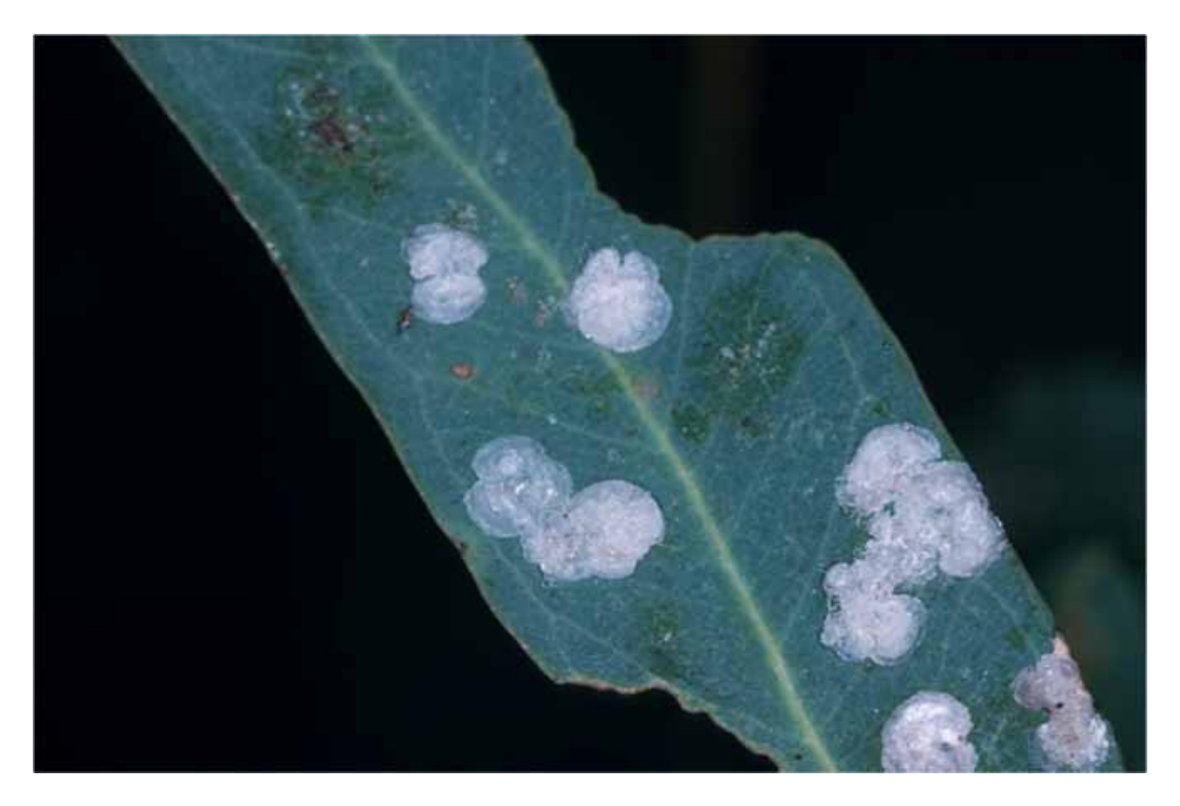
Plate 3. Lerps or sweet secretions of psyllid bug nymphs

The mass rearing of insects for consumption or sustainable harvesting from the wild is an important hurdle that needs to be overcome. Australian Aborigines generally ate the food they collected or caught on the same day or not long after. There are only a few recorded examples of Aborigines preserving insect food to eat later. These include making Bogong moths into a cake (Flood 1980), a caterpillar (could be muluru of the Wangkanguru and Yarluyandi people or anumara of the Arrente people) that fed on grass that had its head pulled off, its body contents squeezed out and the body dried in hot ashes and was either eaten or stored (Hercus 1989; Kimber 1984) and collection of psyllid lerps from eucalypt leaves (Plate 3) that were rolled into a ball that could be stored for months (Central Land Council 2007b; Bin Salleh 1997). The ayeparenye caterpillar feeds on tar vine ( Boerhavis spp.) and was collected in large numbers and gutted ( werlaneme ) and cooked in hot ash; it can also be stored (Central Land Council 2007b). Witjuti grubs that are dug out from inside a piece of Acacia kempeana root will seal up the exposed ends of the root and they can be kept alive for several days and transported within the root (author, personal observation).