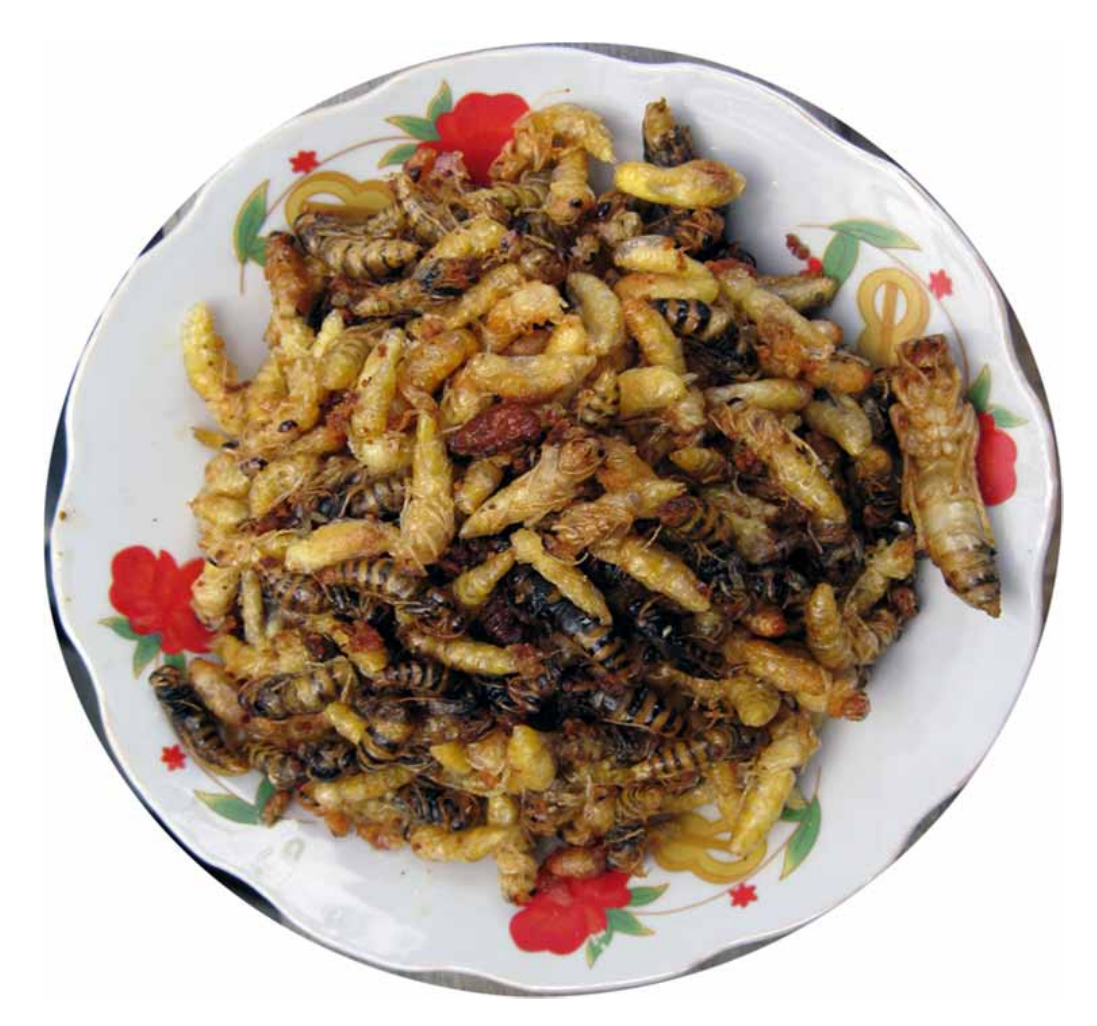
Plate 2. Fried wasp larvae and pupae, Ruili, Yunnan

Table 1 presents the results of amino acid analysis for six species of wasp larvae. The contents of 16 types of amino acids of V. basalis Smith, V. mandarinia mandarinia Smith, P. sagittarius Saussure, P. sulcatus Smith, Vespa velutina auraria Smith and V. tropica ducalis Smith were 43.91, 52.20, 36.11, 45.02, 49.03 and 42.44 percent, respectively. The average content of amino acids was 44.77 percent. The contents of the seven essential amino acids for the human body were 15.15, 24.43, 12.57, 16.08, 16.78 and 14.68 percent, respectively. The average amount of these seven essential amino acids was 16.62 percent, constituting 37.12 percent of total amino acids.