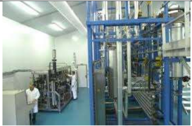
Supercritical CO2 extraction workshop at the Grasse site.