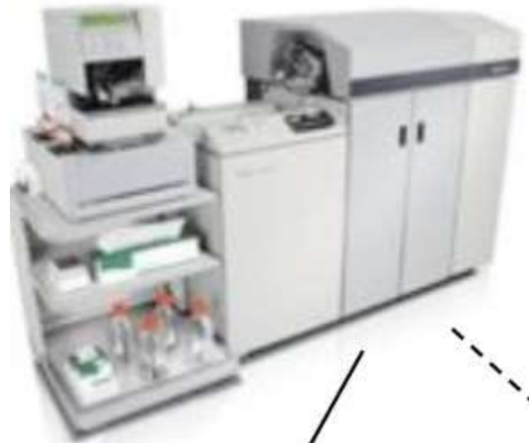
A mass spectrometer for proteomic analyzes

Analyzes carried out internally: organoleptic, physico-chemical analyzes. Analyzes performed externally: gas chromatography.