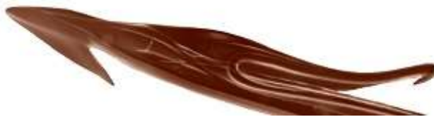
This is the harpoon tip of the radula of a cone snail for hunting fish ( Conus striatus ).

A prefectural decree is probably needed to open such a medical biology laboratory (LBM) (?) (With accreditation by COFRAC and declaration by LBM to ARS (?)) 5 .