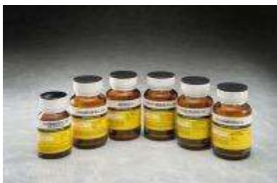
Bottles of 1 gr for the packaging of conotoxins.

Analyzes carried out internally: organoleptic, physico-chemical analyzes. Analyzes performed externally: gas chromatography.