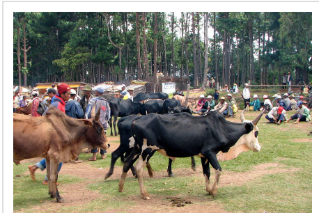
Zebu market in Madagascar

Han-u is a traditional Korean breed, hybrid of Bos primigenius taurus and zebu.