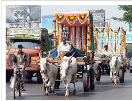
Draft zebu in Mumbai, India

Zebu were imported to Africa over many hundreds of years, and interbred with taurine cattle there. Genetic analysis of African cattle has found higher concentrations of zebu genes all along the east coast of Africa, with especially pure cattle on the island of Madagascar, either implying that the method of dispersal was cattle transported by ship or alternatively, the Zebu may have reached East Africa via the coastal route (Pakistan, Iran, Southern Arabian coast) much earlier and crossed over to Madagascar. Partial resistance to rinderpest led to another increase in the frequency of zebu in Africa.