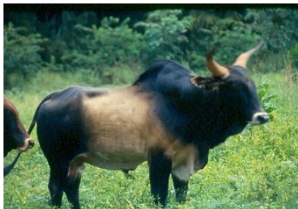
Speculative life restoration of the enigmatic Indian aurochs ( B. p. namadicus )