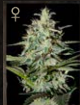
WHITE STRAWBERRY SKUNK