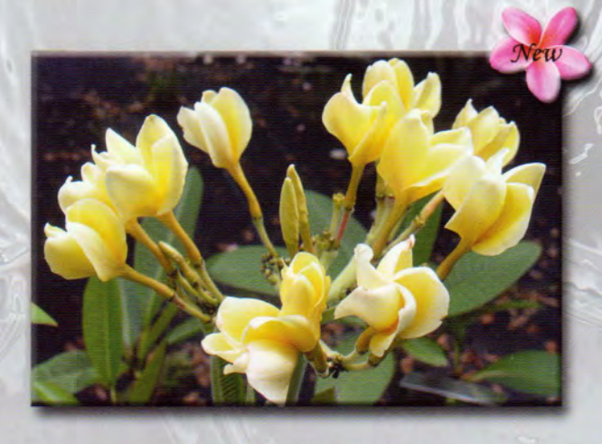
Vera Cruz Lutica