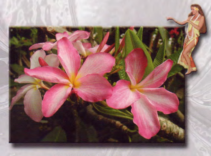
Pink White Velvet