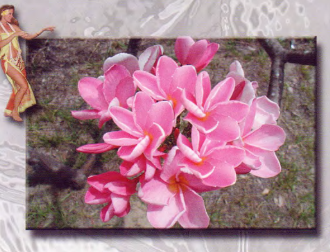
Pretty in Pink