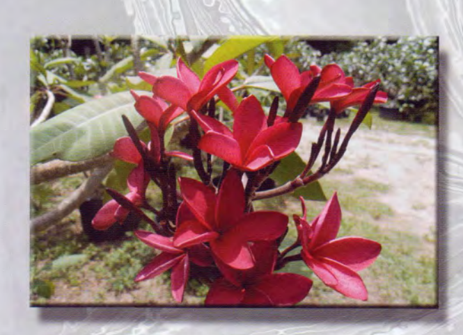
Key West Red