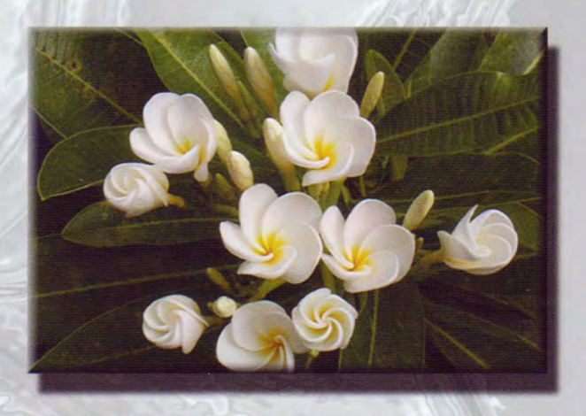
Dwarf Singpaore White