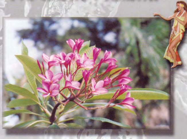
Key West Pink