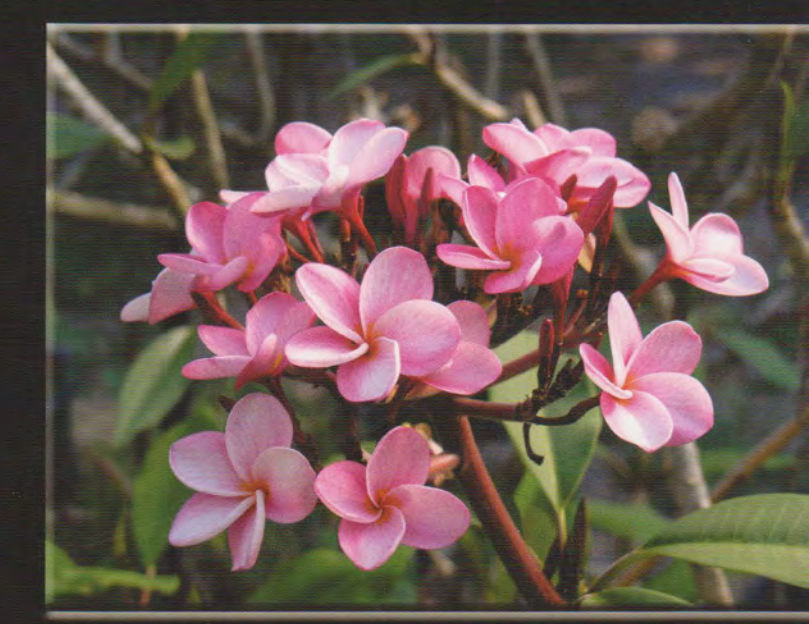
The World's Number One Plumeria Catalog