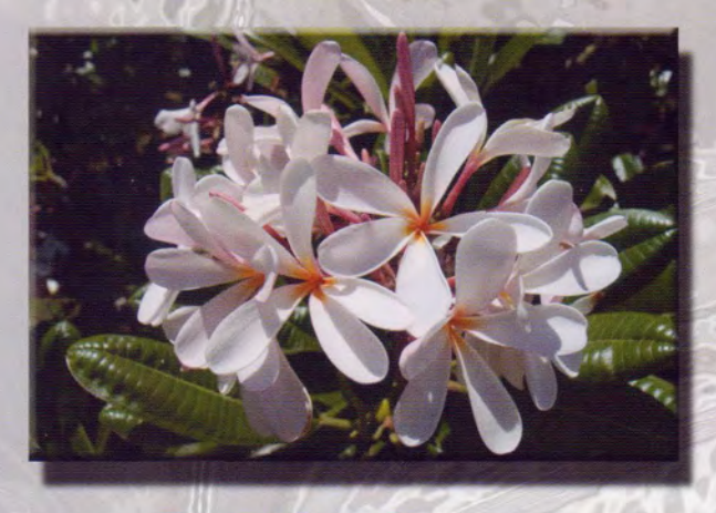
Dwarf Pink Singapore