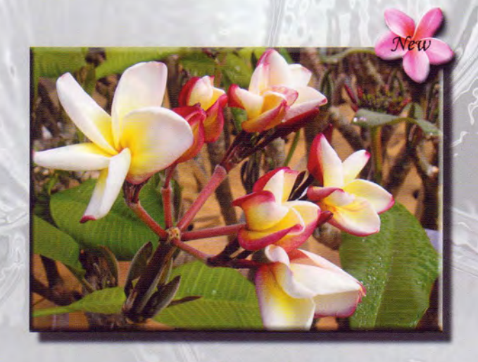
Vera Cruz Rose