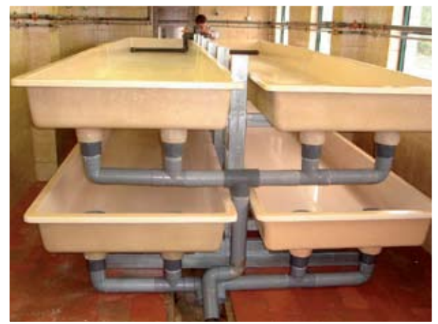
A trial version of a shallow raceway systems at a farm (A. Coelho & Castro) in northern Portugal.

focus of activities with these species with almost 80% of the participants coming from Spain or Portugal. Five other European countries (Norway, the Netherlands, UK, Greece and Italy) were also represented.