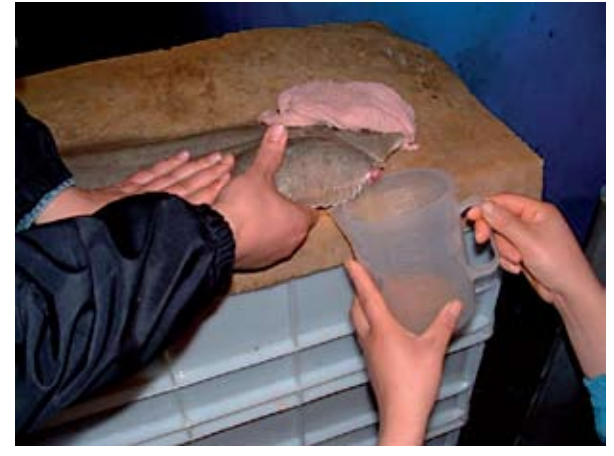
Stripping eggs from Senegal sole in China

both systems had proved successful in commercial experiences.