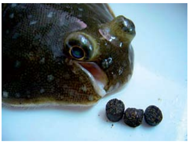
Sole pellets

The nutrition of the larval stages is of particular importance because of the long lasting effects that deficiencies may have. In this respect, the availability of radioactive and stable isotope techniques for fast-track studies of nutritional requirements and feeding strategies for sole larvae and juveniles is particularly important and will accelerate our understanding of requirements. With regard to specific requirements of larvae, evidence was presented that supported the role of Vitamins A & K in the modulation of the prevalence of skeletal deformities.