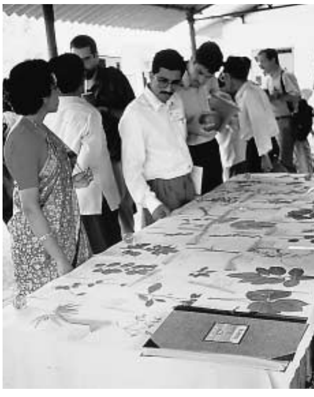
Photo 11. Workshop participants looking at herbarium samples displayed at the Rural Development Centre, IIT, Kharagpur.

Third, the shift from subsistence use to commercial harvesting, with commercial demand from towns or cities in the case of regional trade or for export in the case of international trade (such as for rattan, medicinal plants, selected fruits, and oilseeds), provides an incentive to overturn customary controls of resource use. Harvesters are often people with low incomes and few resources in reserve. The temptation to "mine" rather than manage the resources is high, particularly when there are many other harvesters as a result of high local unemployment or where resource tenure is weak.