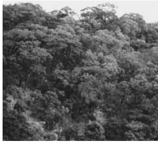
Photo 6. Dry miombo woodland dominated by Brachystegia boehmii and B. spiciformis (Caesalpiniaceae), Likubula, southern Malawi.

By contrast, miombo (Brachystegia - Julbernardia - Isoberlinia) and mopane (Colophospermum mopane) woodlands, with poor soils, tsetse flies and malaria, are less densely populated, far more extensive and have far greater potential for JFM.