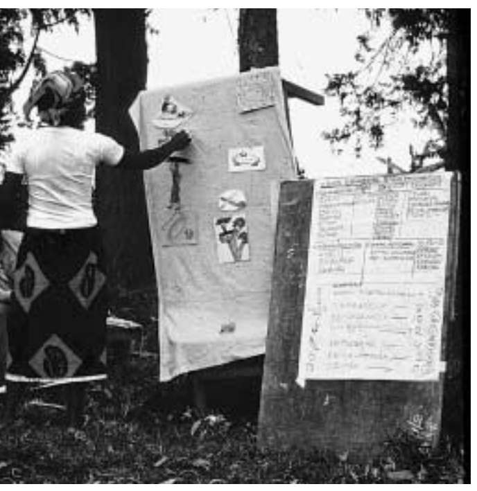
Photo 14. Conflict resource management: an example of the use of the flanel board to prioritize resources at Bwindi, Uganda.

Trust building took place in group sessions encouraging wide debates and allowing people