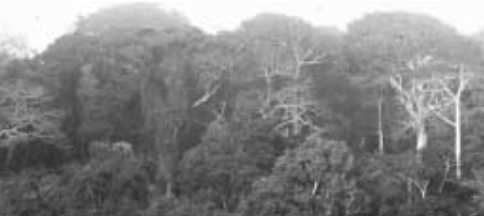
Photo 7. Sustainable management of diverse forests such as this one in coastal Kenya is particulally complicated.

vesters and uses of a species and the scarcer the resource, the greater the chance resource managers and local people will get embroiled in a complex juggling