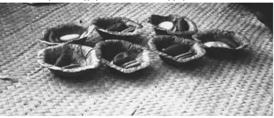
Photo 13. Sal plates produced with non-conventional press at the Rural Development Centre, Kharagpur.

The idea of suppressing middlemen so that producers may get more income is naive because the middlemen also need to make a living and would probably turn