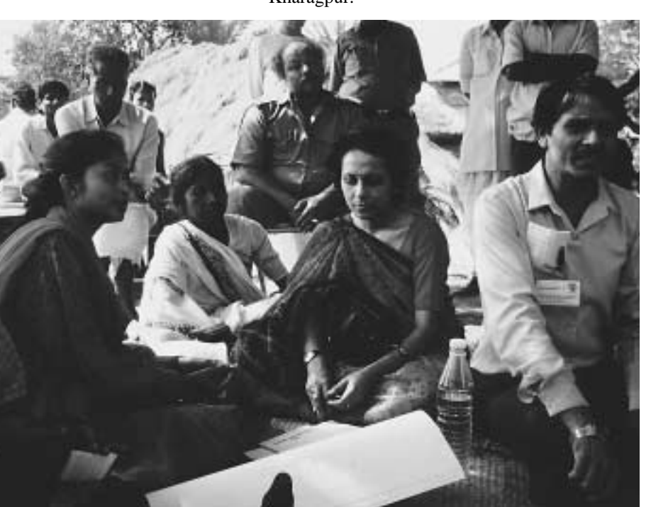
Photo 5. At the beginning of the discussions the Forest Officer chose to sit separated from the rest of the group in the background. This changed during the course of the workshop.

The JFM research network is still growing and evolving and there have been some problems. However, it is encouraging that people from so many different disciplines are coming together to search for viable alternatives for the twin objectives of empowering the local community and reversing the process of forest degradation. As the network does not have any predefined boundaries, it is hoped that it will continue to grow and evolve in the future. It has provided, and will continue to provide, a forum for the exchange of ideas and healthy debate between all involved in the complex task of JFM It was in this spirit that this JFM workshop was held in Kharagpur.