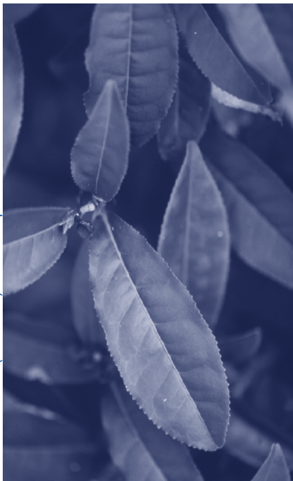
Camellia sinensis (Green tea)