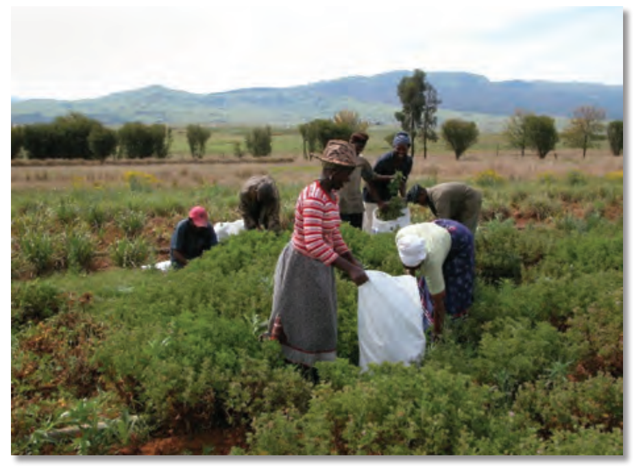
Hand harvesting of rose geranium on research trials in the Eastern Cape