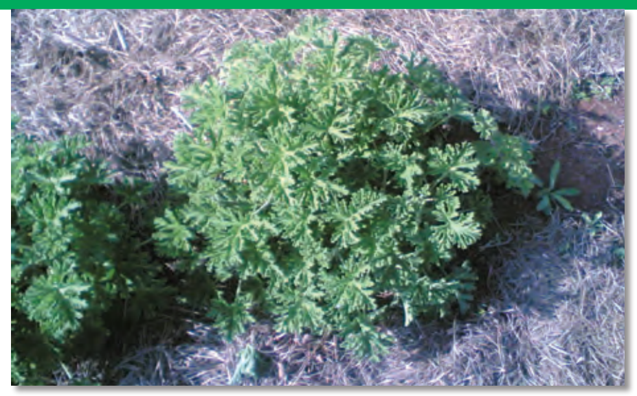
Mulching prevents weed growth and soil moisture loss

Control: Prevention methods include spraying with insecticide as soon as insects appear. Harvesting the crop immediately is advised. Control insects at land edges and road verges.