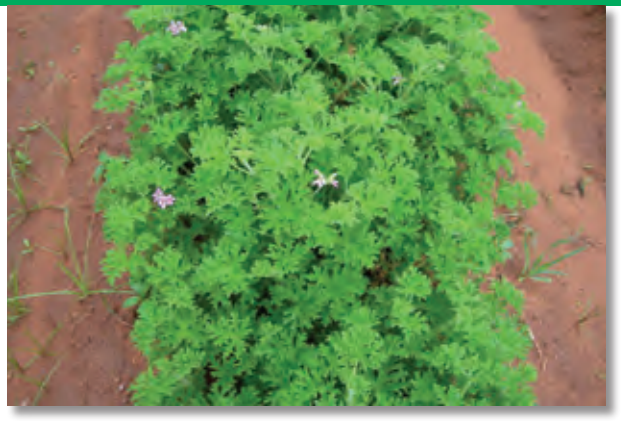
Pelargonium cv. rosé