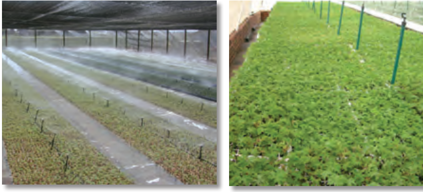
Propagation of cuttings in nurseries