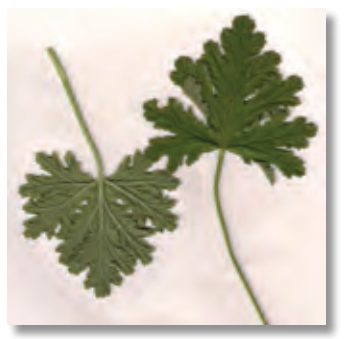
Pelargonium cv. rosé