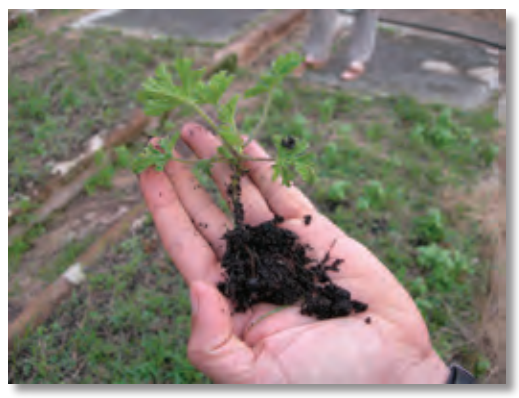
Healthy rooted cutting