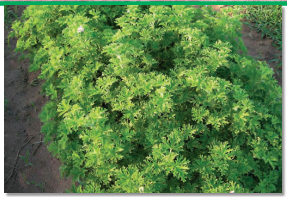
The time of harvesting affects the yield and quality of the oil