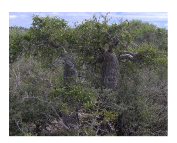
Photo 2: Operculicarya decaryi, habitat in Cap Sainte Marie Tsihombe