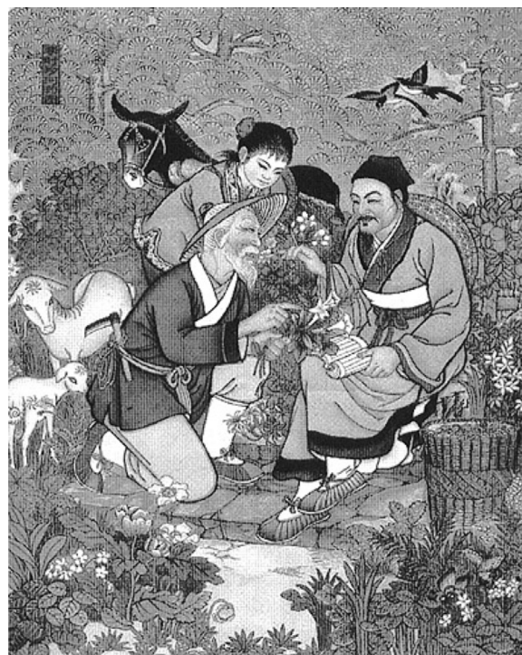
Fig. 2. Image from the Chinese Materia Medica depicting the investigation of plant material.

Over 600 phytochemicals have been identified in Artemisia annua (Brown, 2010), all of which will be ingested when the leaves of Artemisia annua are consumed. There is currently no scientific literature available on the chemistry, effect of the preparation method (harvesting, drying, storage etc.) and overall