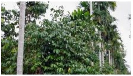
Habit of fruiting (Rafael T. Cadiz)